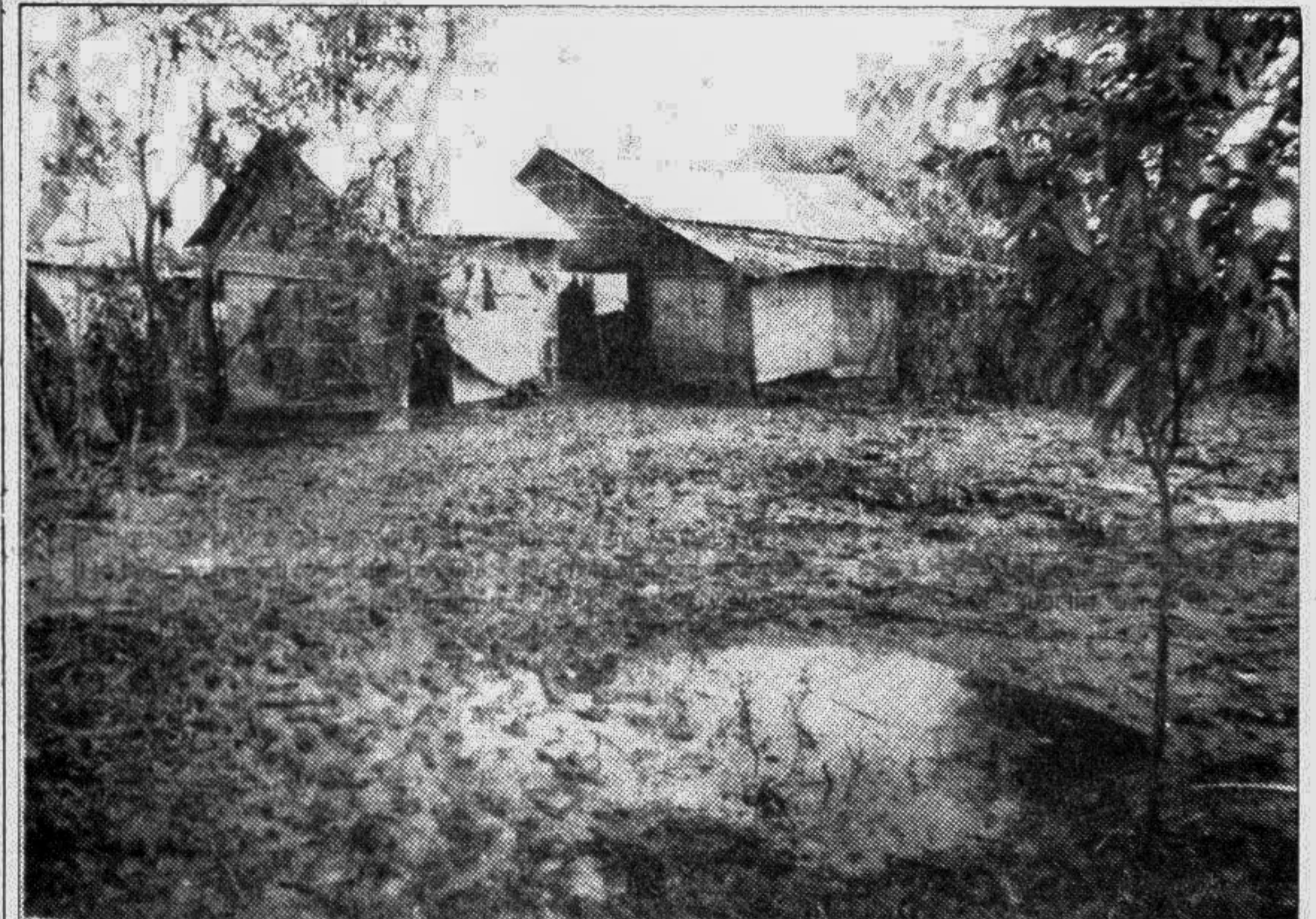
THE UNUSUAL ONSLAUGHT: A section of the people in the Narayanganj-Narsingdi Agrani Irrigation Project at Rugganj is still paying the price for the recent flooding. (Top) A weaver works in a makeshift house on the embankment-cum-road as his house is under water. (Middle) Farmers find it difficult to resume cultivation due to stagnant floodwaters on the land. (Bottom) Although water has receded, life in the flood-ravaged houses is yet to return to normalcy.