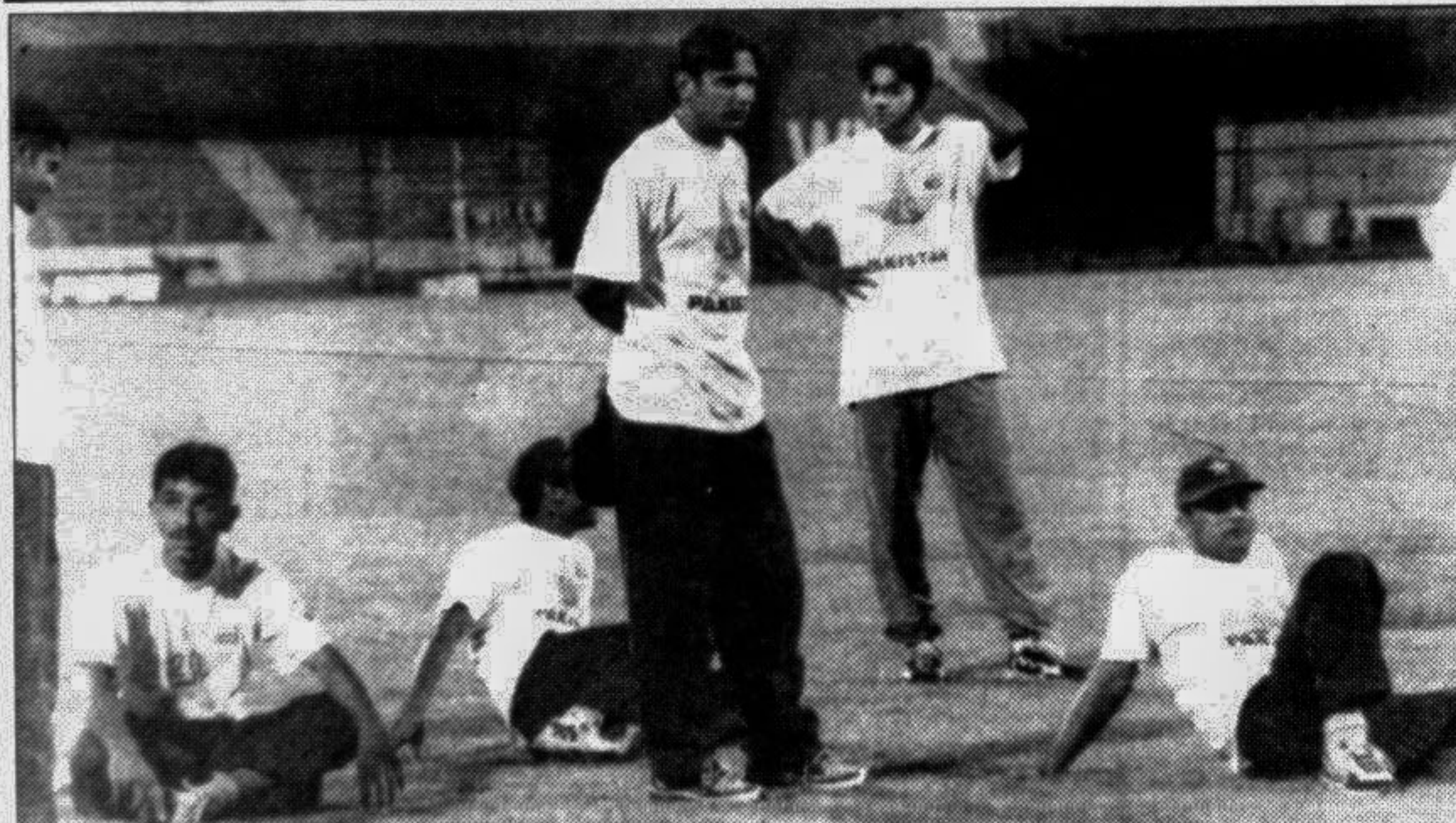
Pakistan cricketers resting after some practice at the Bangabandhu Stadium last night.