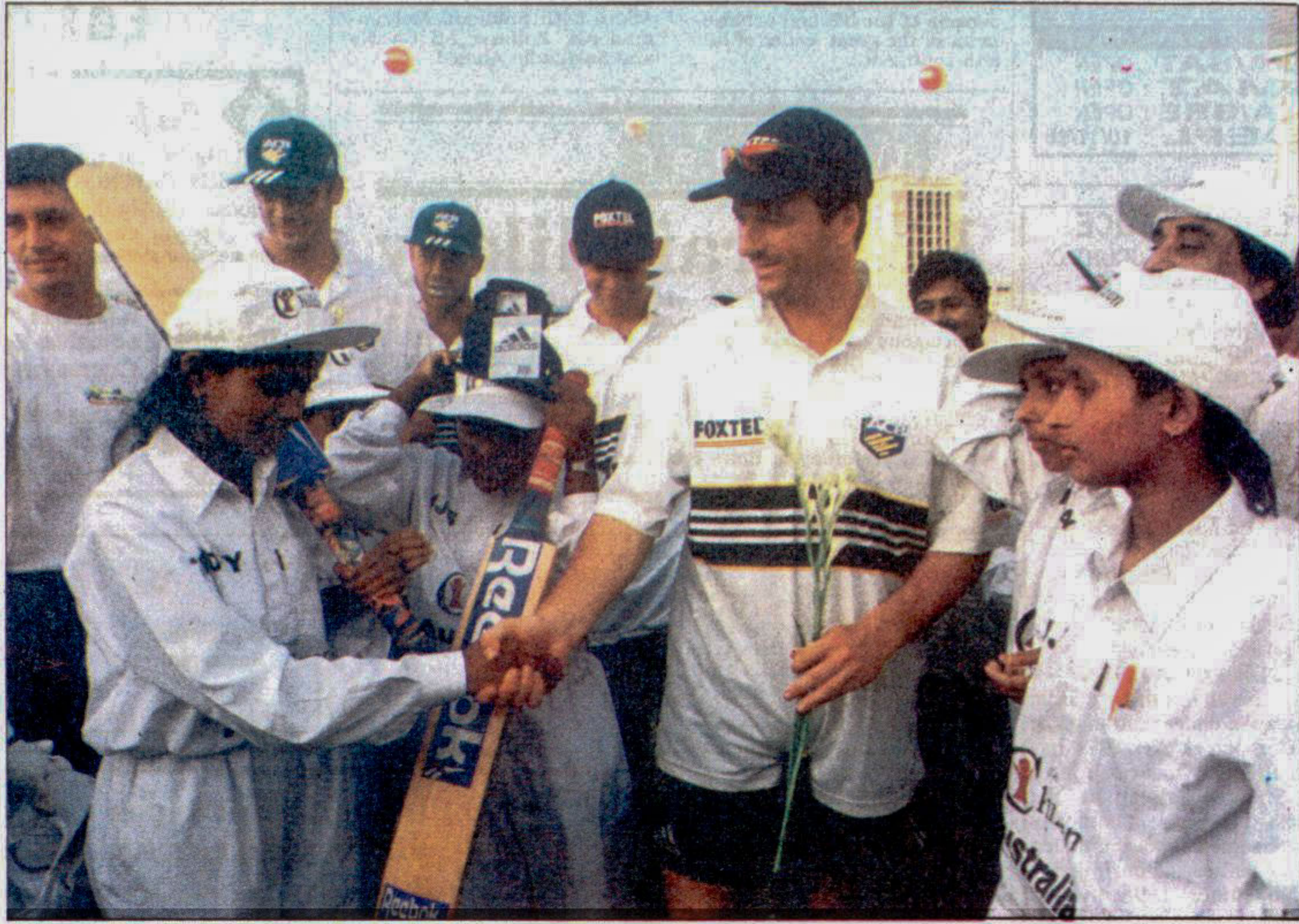
Aussie captain Steve Waugh shakes hands with a child while presenting an autographed bat as part of imparting cricketing lesson to local children and fund raising for Save the Children Australia's Bangladesh Appeal.

BKSAL? By Staff Correspondent 'Join BKSAL' - this graffiti, all of a sudden, has become a common sight in some parts of the city these days, reminding many of the one-party system once introduced in the country 23 years back.