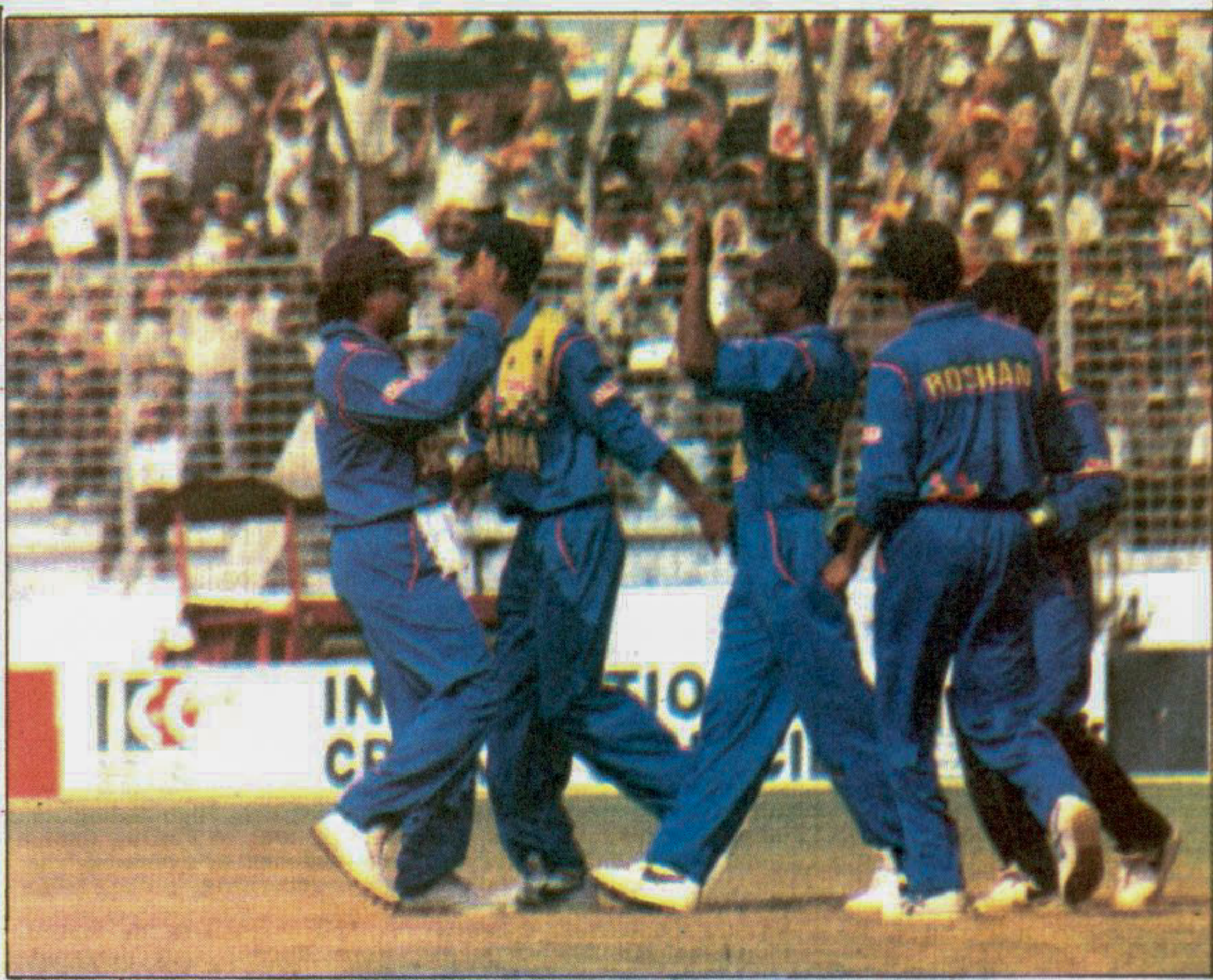
Jubilant Lankan cricketers celebrate the fall of a New Zealand wicket yesterday.

By Mahbub Zaman The ongoing Wills International Cup cricket tournament has changed the scenario on the Dhaka University campus. The campus takes a barren look as students rush to the dormitories or homes while the lucky ones to the stadium well before it is 2 o'clock in the afternoon, the time matches start. And popular places like TSC Island, mall area are no longer favourite sites for the students and visitors. DUS, the well-known snacks shop at the TSC island, has installed a TV in front of the Shoparjita Swadhinata to lure customers in an otherwise dull business. A good number of cricket fans thronged there yesterday evening to enjoy cricket. TV rooms of the halls are packed with the cricket-crazy students. The unfortunate ones have to watch TV on their feet as hall authorities are yet to have enough seats for them. Students who are forced to stay in the classrooms, or examination halls or in the library carry radio sets to keep themselves in touch with the latest at the stadium.