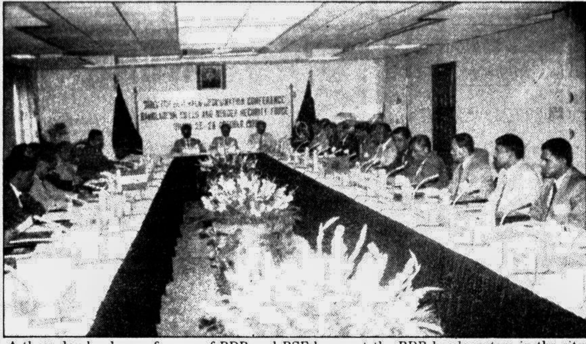
A three-day border conference of BDR and BSF began at the BDR headquarters in the city yesterday.

It expressed concern over the alleged irregularities in the procurement of ATP and Airbus. The meeting discussed various issues of procurement, especially procurement of ATP and Airbus.