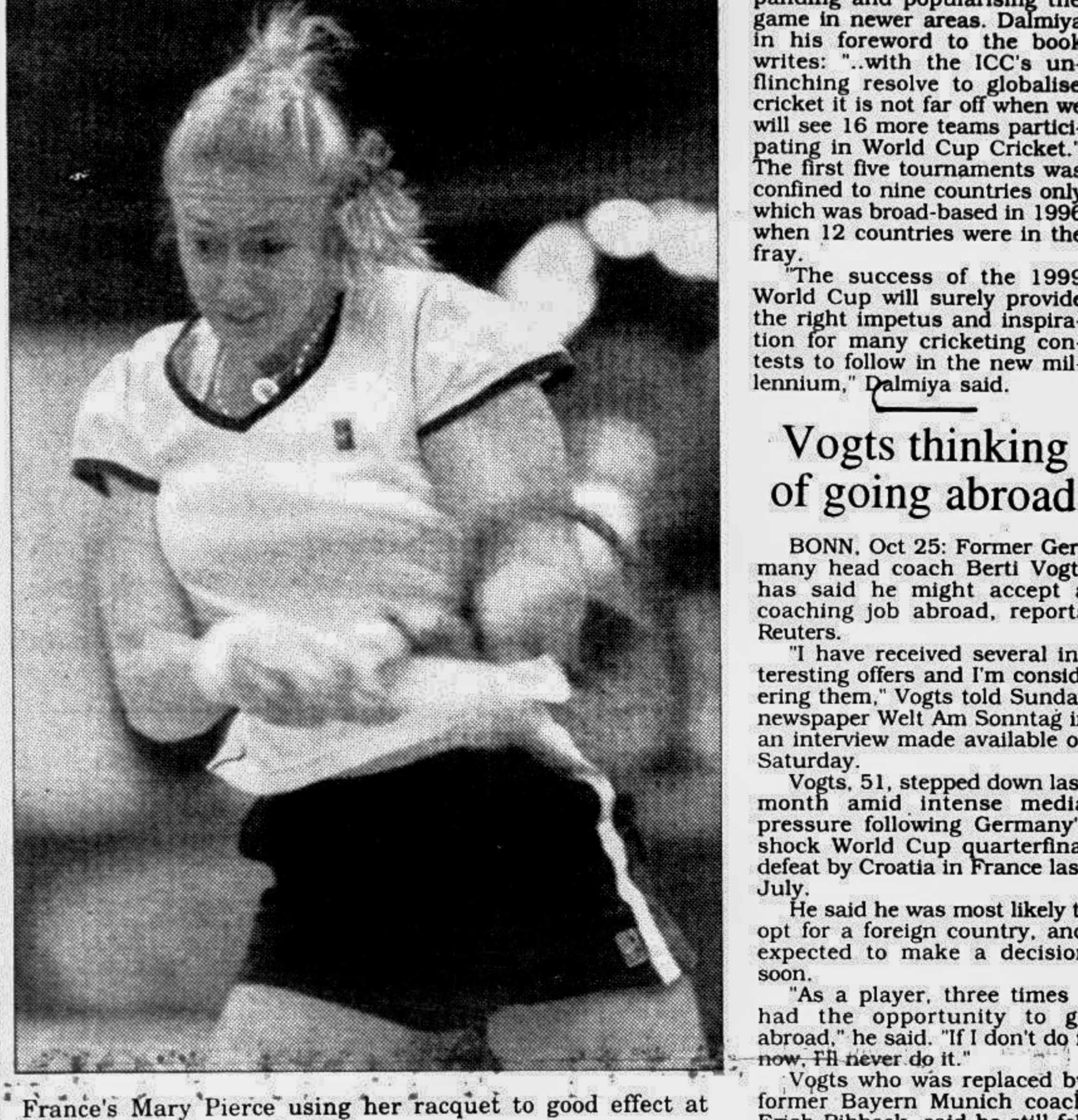
France's Mary Pierce using her racquet to good effect at the Kremlin Cup on Oct 23.