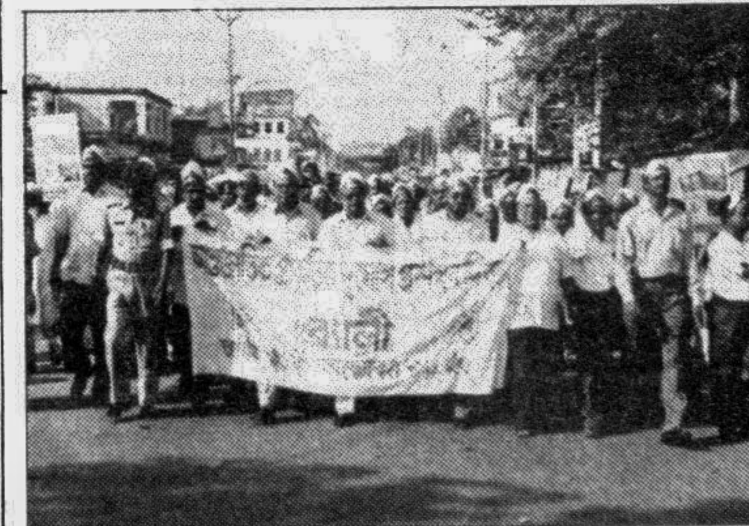
PABNA: The district administration brought out a colourfull rally in the district town recently on the occasion of International Disaster Reduction Day.