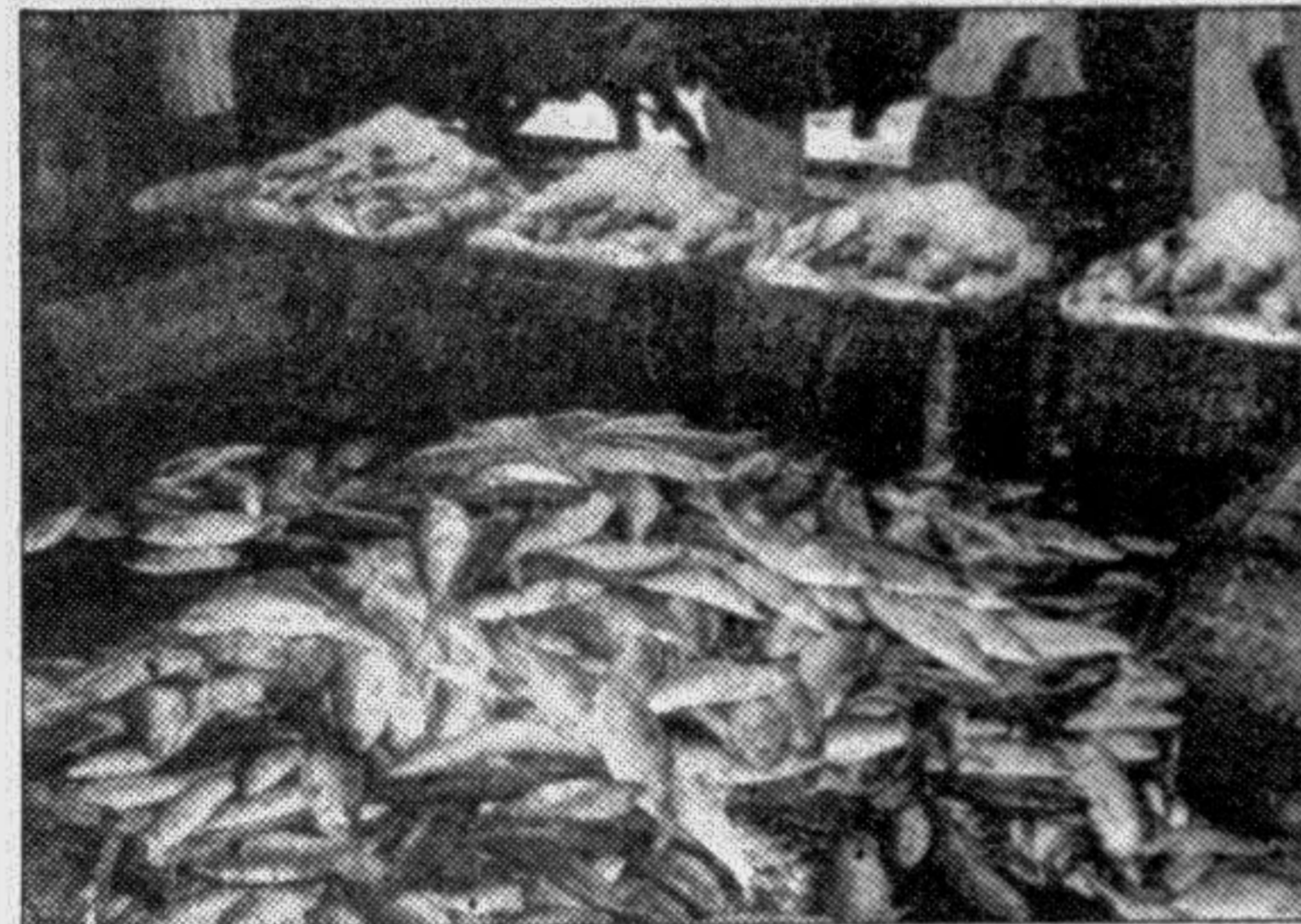
CHANDPUR: Hilsa fish being processed at the local market.

The environmental changes and gradual siltation of rivers have reduced the natural flow of water in the river Padma, Meghna and other rivers. As a result the spawning ground of the hilsa has been decreased. The construction of embankments and irrigation projects has also given negative impacts on the normal func-