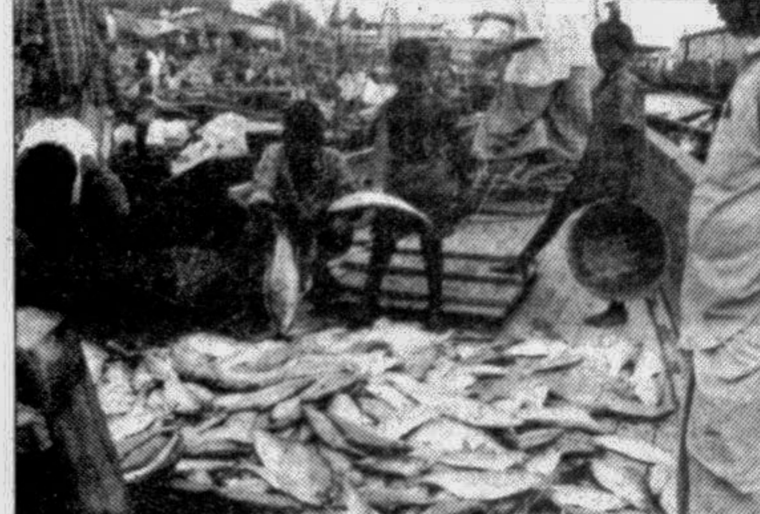
CHANDPUR: Labourers weighing hilsa for the purpose of exporting.

4,000 metric tons of 'jatkas' were caught annually in these areas. So fishing 'jatka' affects sharply on our valuable fish resources.