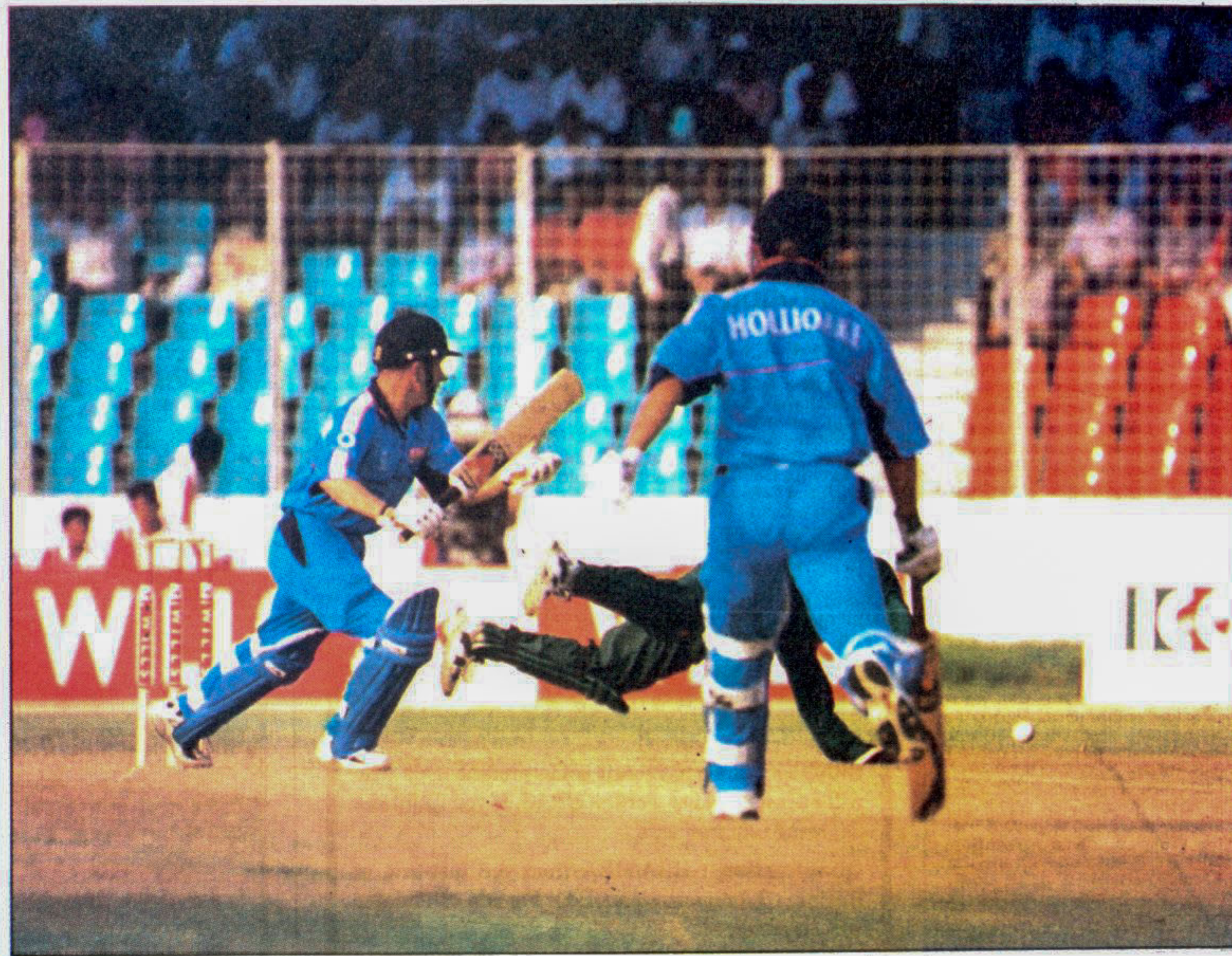
UNORTHODOX YET USEFUL: Neil Fairbrother, the left-handed England batsman, follows a mishit that paced past the outstretched South African wicketkeeper Mark Boucher down to thirdman. Also interested is his captain Adam Hoolioake.

Business BSCIC to invest Tk 1500 cr in industrial projects this fiscal Vajpayee announces string of steps to revive sagging economy DSE, CSE price quotations Pages 6, 7 & 8