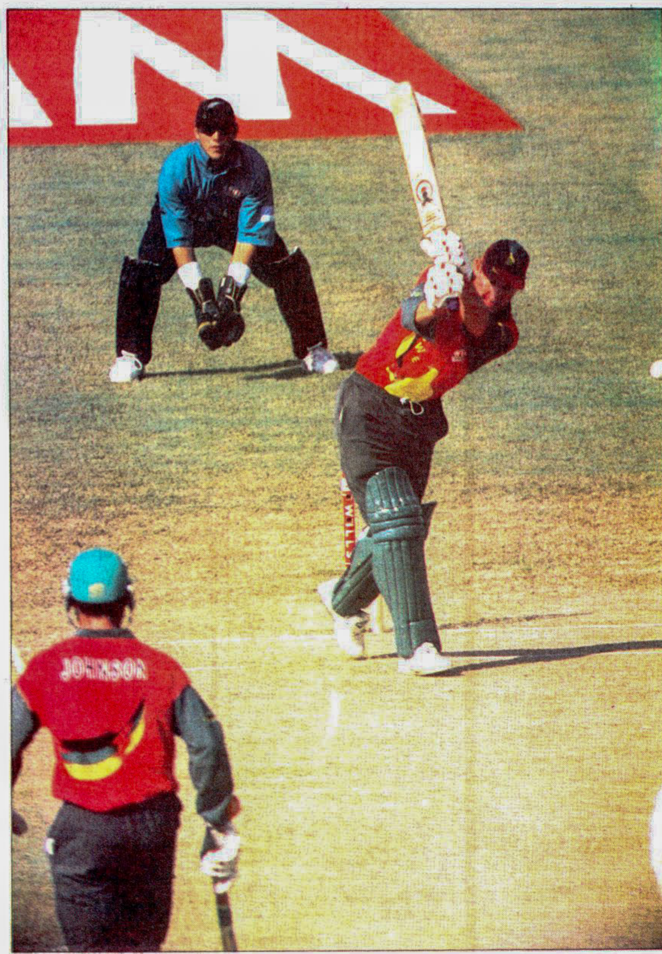
Alistair Campbell, the Zimbabwe captain drives on his way to scoring a century during yesterday's opening match of the Wills International Cup against New Zealand at the Bangabandhu National Stadium.