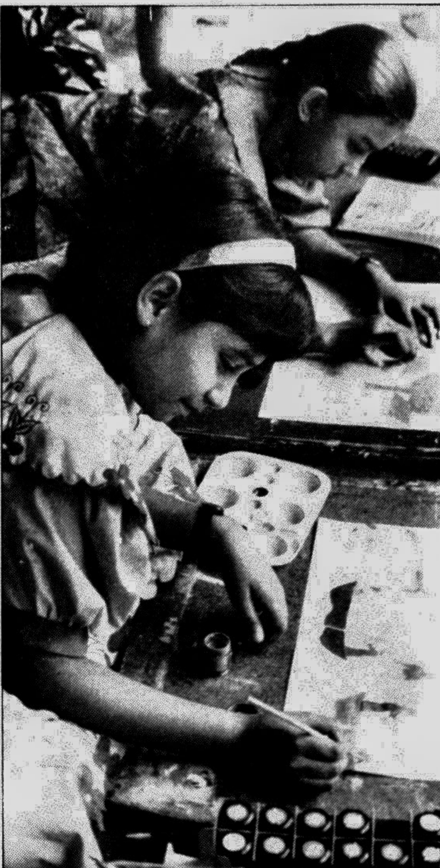
A drawing competition for children was held at the Institute of Fine Art, DU, on the occasion of the 7th founding anniversary of Purbita, an organisation of women artists, yesterday.