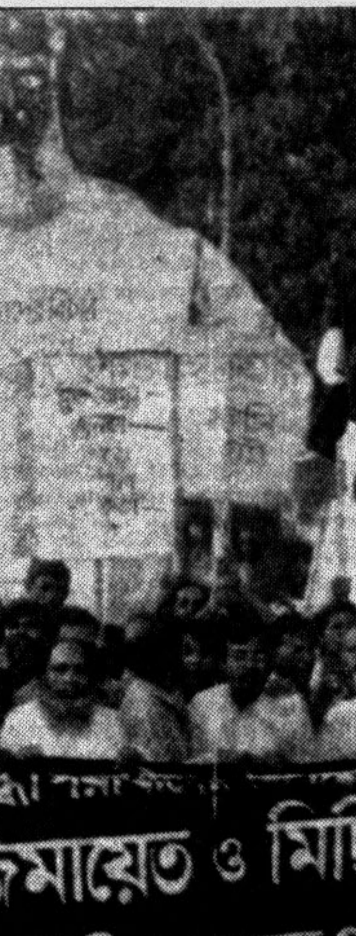
The Mukti Juddha Sangsad Kendriyo Samannaya Parishad brought out a procession in the city on Wednesday demanding trial of all war criminals including Golam Azam.

The Mukti Juddha Sangsad Central Coordination Council has demanded that the government give an immediate declaration of holding trials of all war criminals including Golam Azam. The Mukti Juddha Sangsad Central Coordination Council has demanded that the government give an immediate declaration of holding trials of all war criminals including Golam Azam.