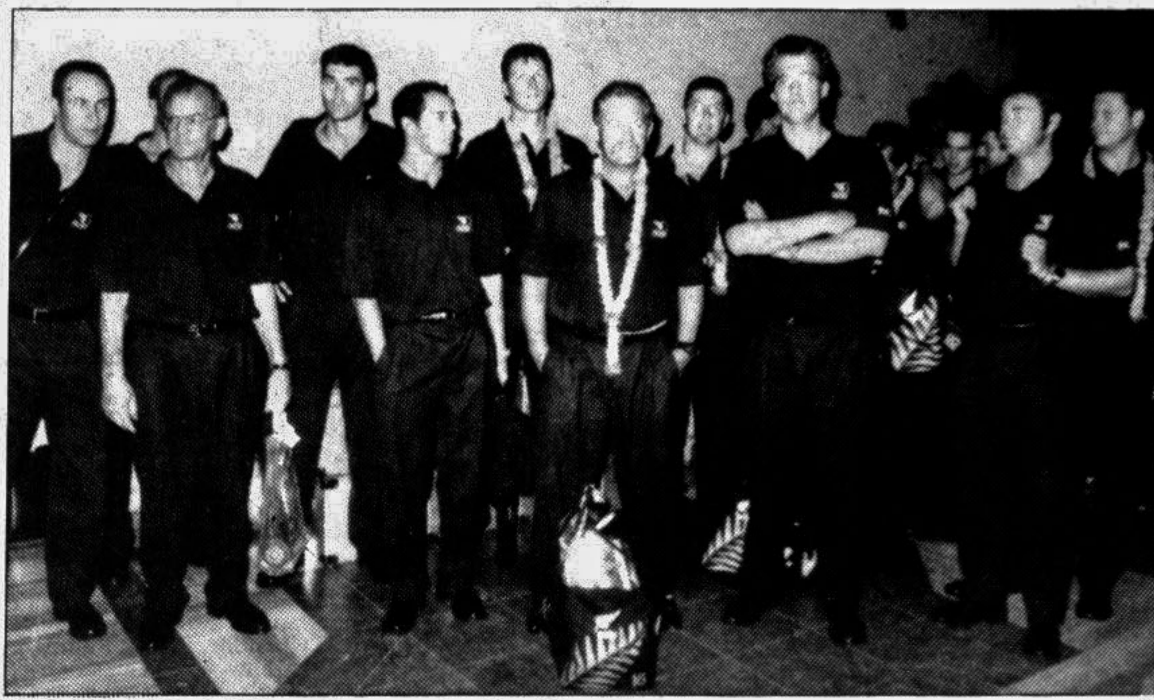
THE "BLACK CAPS" ARE HERE: The New Zealand team pictured on arrival at the Sonargaon Hotel last night to take part in the Wills International Cup.