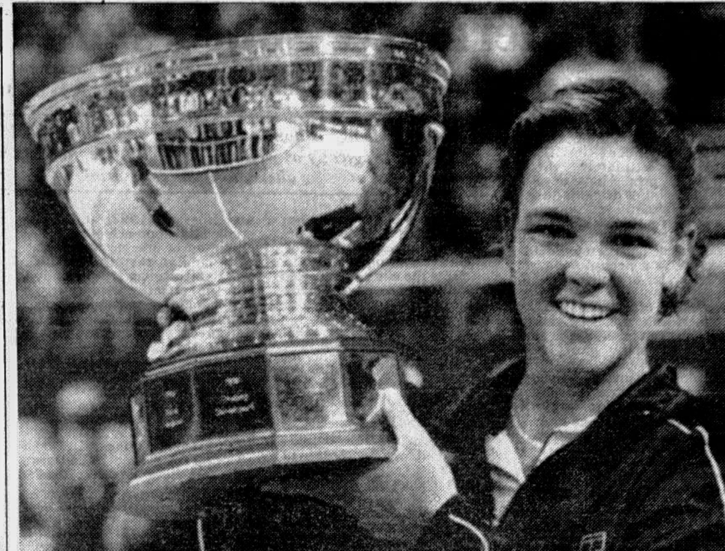
World number one Lindsay Davenport displays the European Indoor championship trophy after she downed Venus Williams on October 18. Davenport won 7-5, 6-3.