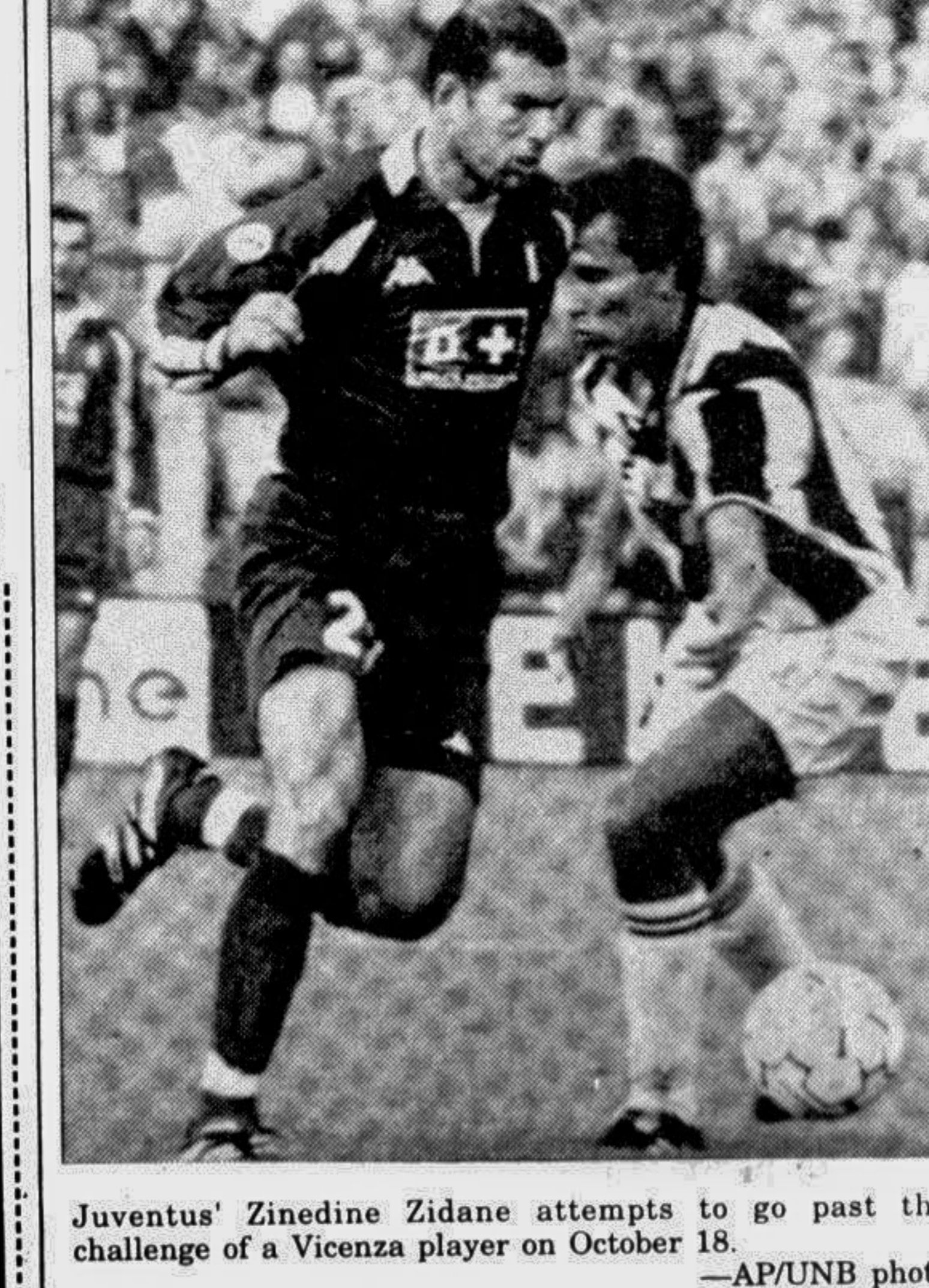
Juventus' Zinedine Zidane attempts to go past the challenge of a Vicenza player on October 18.