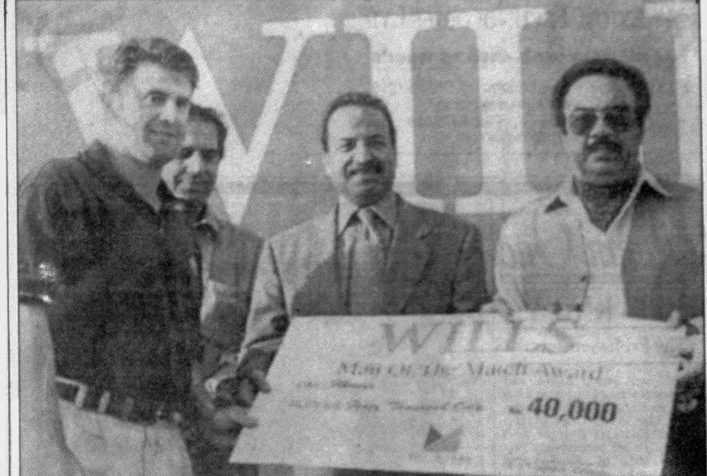
Australian skipper Mark Taylor (L) receives his cheque during the prize-giving ceremony of the second Test in Peshawar yesterday.