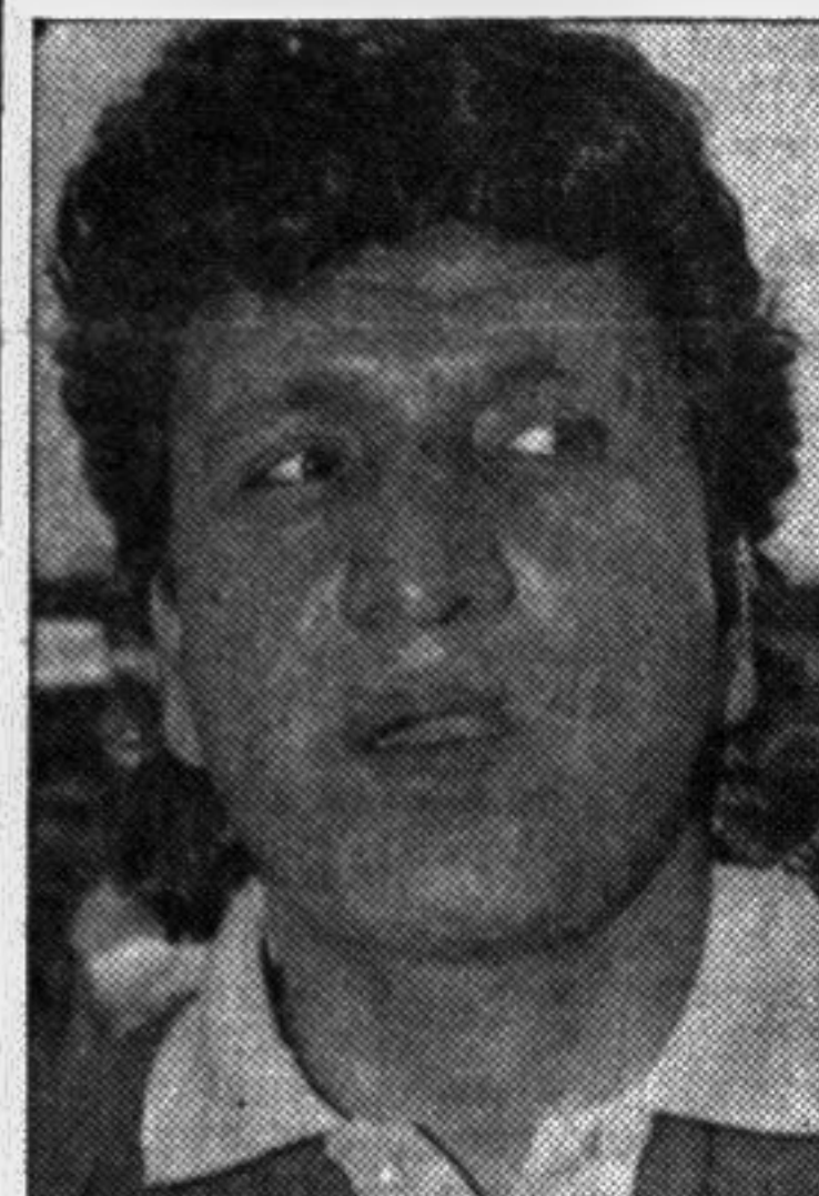
The Pakistani spinner faded out of the international action in 1992-93 after he broke his leg during an exhibition match in England.

Qadir came to prominence in 1977-78 when he took six wickets in a Hyderabad Test against England, he took 9-56 against England in the Lahore Test in 1987-88, his best bowling in Tests.