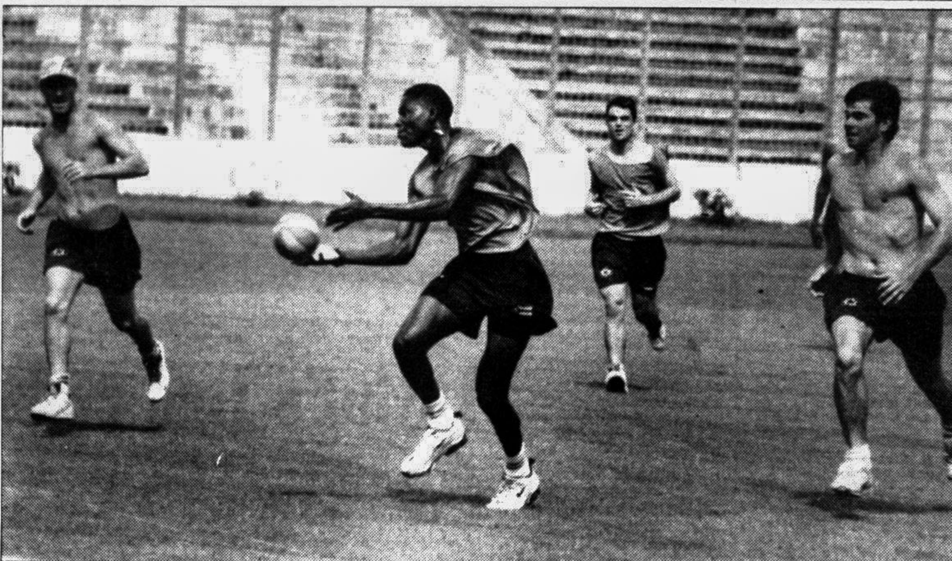
A BANGABANDHU STADIUM FIRST? Zimbabwean cricketers to the Wills International Cup took to rugby at the Bangabandhu National Stadium yesterday morning during a warming-up session.

Thailand 4 (Pisan Ramra 23, Suthes Suksomjit 38, 71, Thongchai Akarapong 54) India 0.