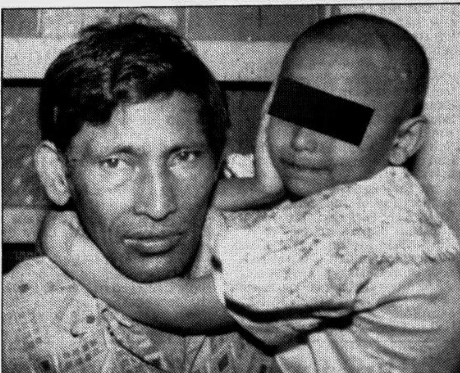
The six-year-old rape victim (eyes covered to conceal identity) on her father's lap after being released from the judicial custody yesterday.

The Italian envoy stressed the need for creation of stan-