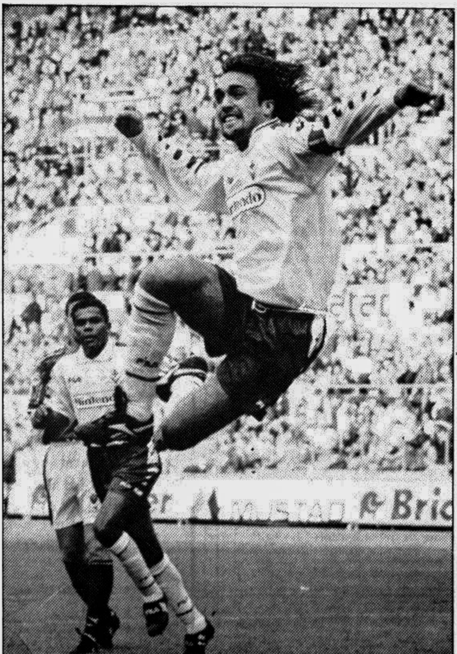
'BATIGOL' TAKES OFF: Fiorentina's Argentine striker Gabriel Batistuta is ecstatic after giving his side the lead against AS Roma in a Serie A clash at Rome on October 17. Roma, however, scored twice in the last four minutes to snatch an unlikely 2-1 victory.