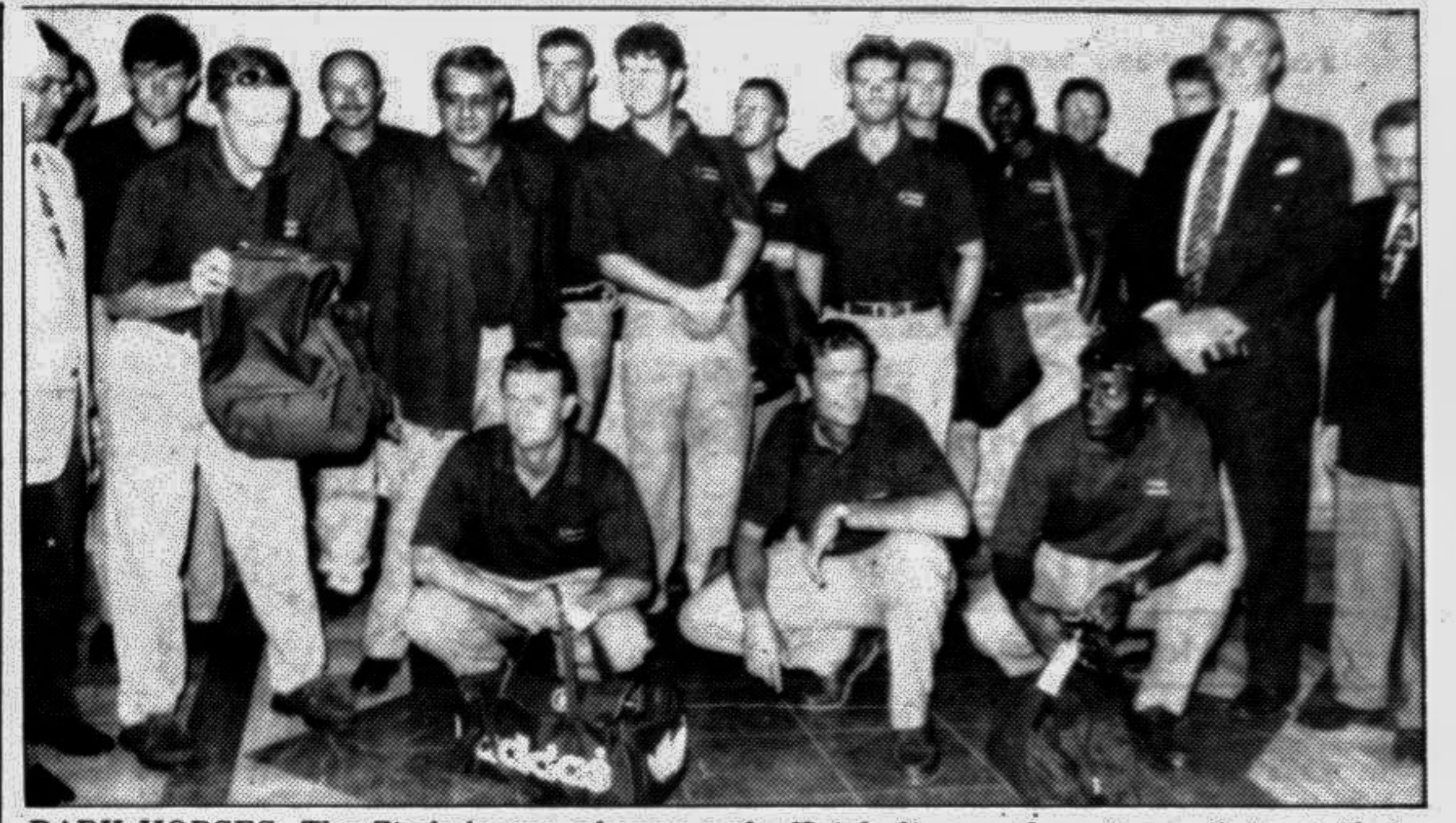
DARK HORSES: The Zimbabwean players and officials line up for a team photo at their hotel lobby yesterday.

Reno recalled the bombing that shattered the Olympics in the summer of 1996 "as thousands milled nearby." She said authorities were determined to press ahead against senseless violence.