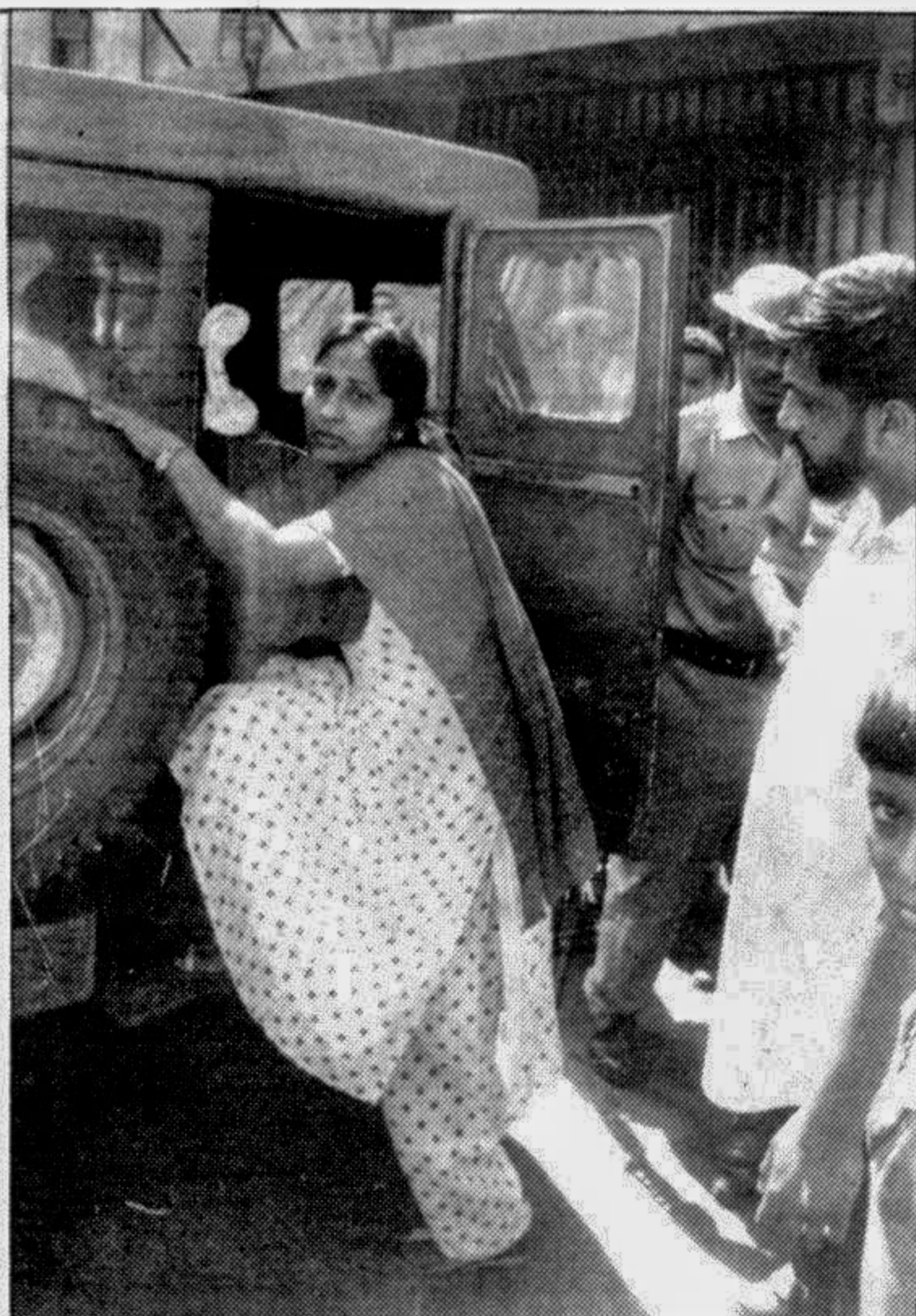
Police picked up a woman on charge of picketing in Joykai Mandir Road area during hartal hours yesterday.

The launch owners associations of Pabna and Rajbari district have welcomed the step.