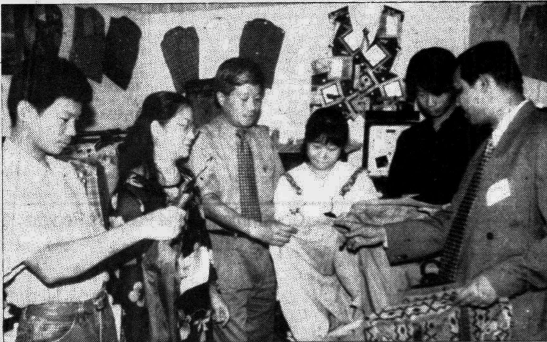
Foreign buyers take a look at some apparel on display at BATEXPO '98 at Sonargaon Hotel yesterday.

Hasina said garment industries have been playing an important role in steering the country's economic growth.