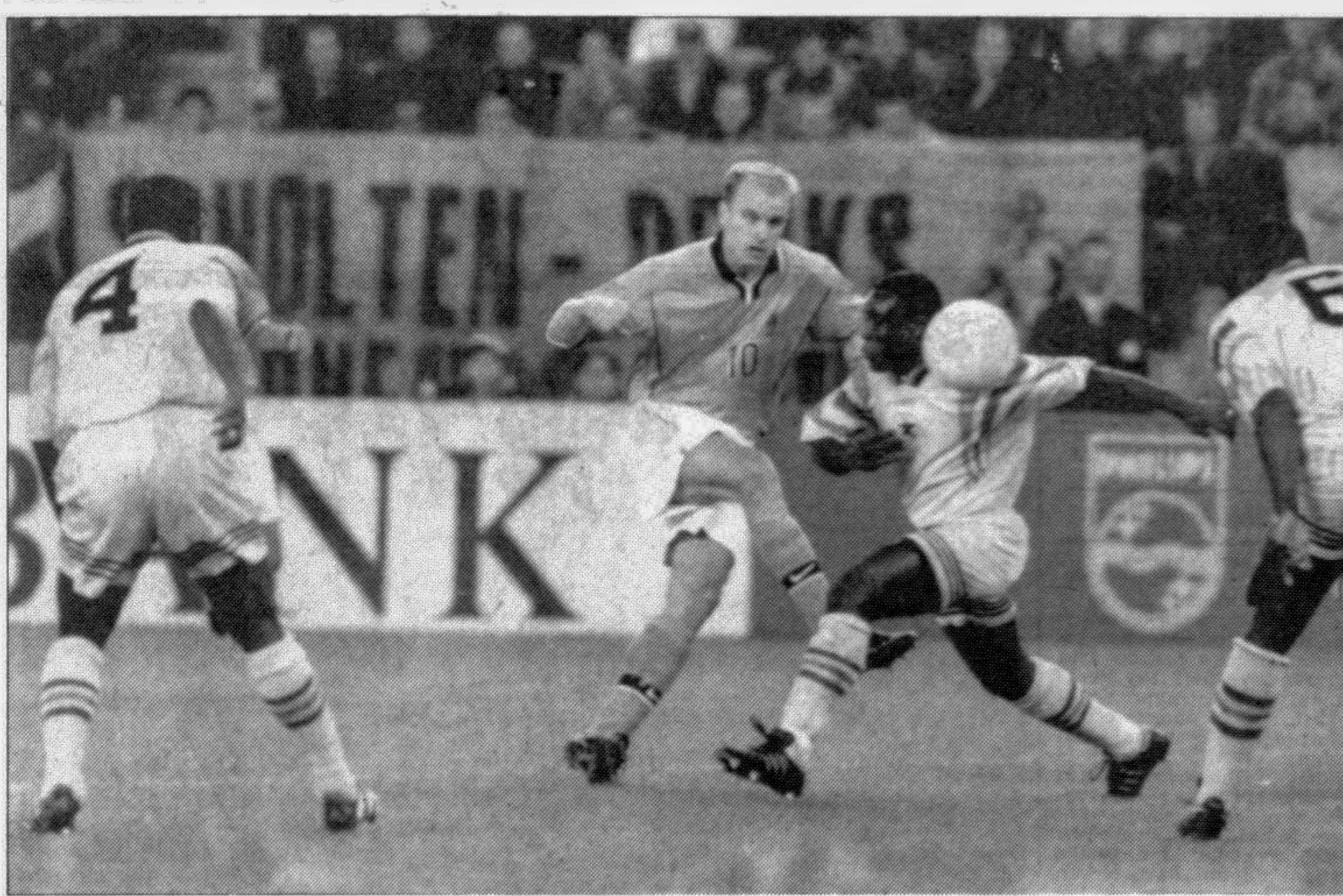
Dennis Bergkamp (C), the Dutch striker shoots amidst a host of Ghana defenders during their friendly at Arnheim, Netherlands on October 13. The match ended 0-0.