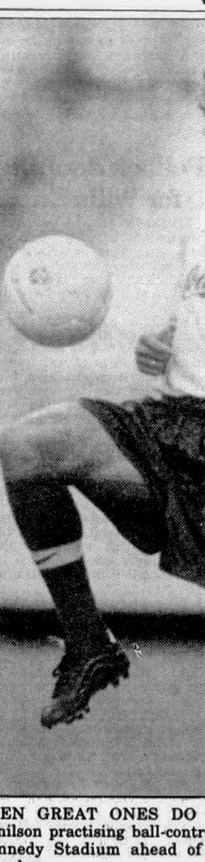
EVEN GREAT ONES DO THE BASICS: Superstar Denilson practising ball-control on Oct 13 at the Robert F Kennedy Stadium ahead of Brazil's friendly against Ecuador.

"We would like a situation where no-one is trying to get horrible little photos through windows or standing in the gates of hospitals and not giving him the privacy to try to rebuild what he wants in life," said Robson.