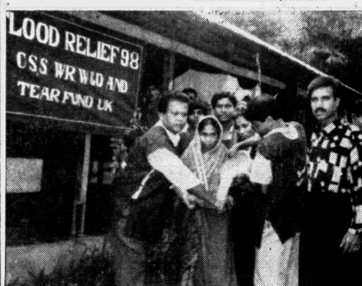
GOPALGANJ: The unit manager of Christian Service Society (CSS) recently distributed relief materials among the flood victims in Bedgram CSS Office premises.