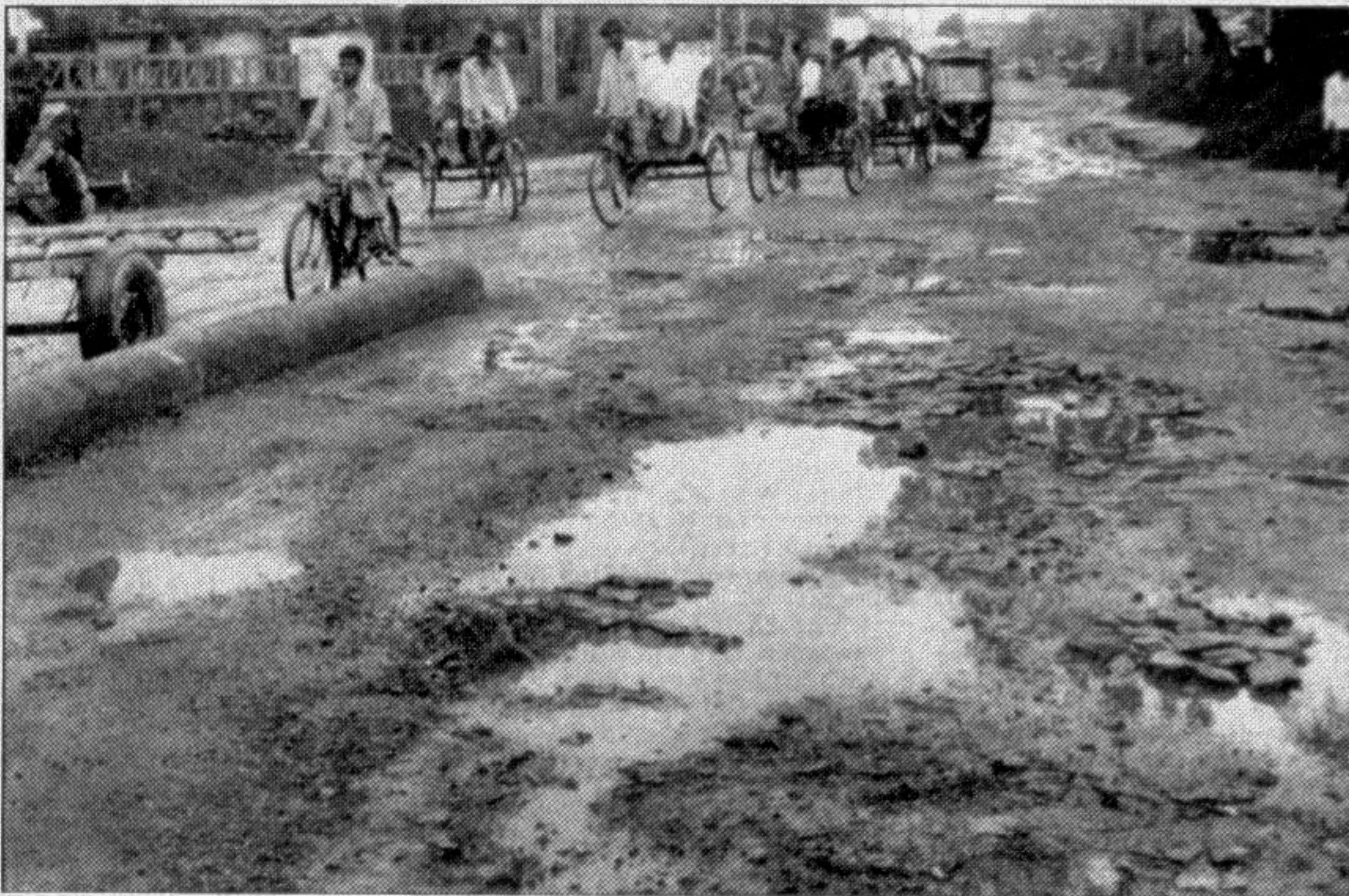
MYMENSINGH: Transport vehicles are running at great risk on flood ravaged Mymensingh-Dhaka Highway. The photo was taken recently from Mashkanda Inter-District Bus Terminal.

After a long hearing of the case and examining the relevant documents and witnesses, the judge gave the verdict.