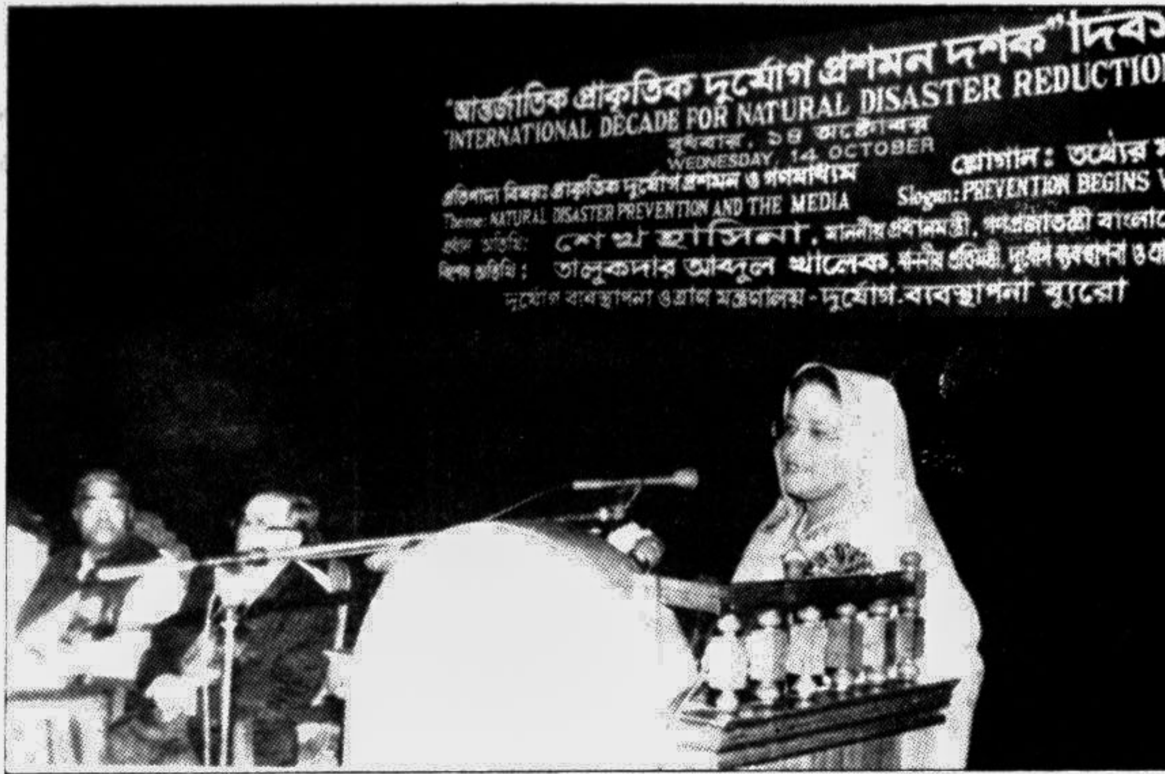
From now on, the roads and highways will be constructed above the flood level, Prime Minister Sheikh Hasina told the inaugural function marking the International Decade for Natural Disaster Reduction Day at the Osmany Memorial Auditorium yesterday.

Rotary Club meet: The regular weekly meeting of the Rotary Club of Dhanmondi will be held. Venue: Dhaka Club. Time: 5:30 pm.