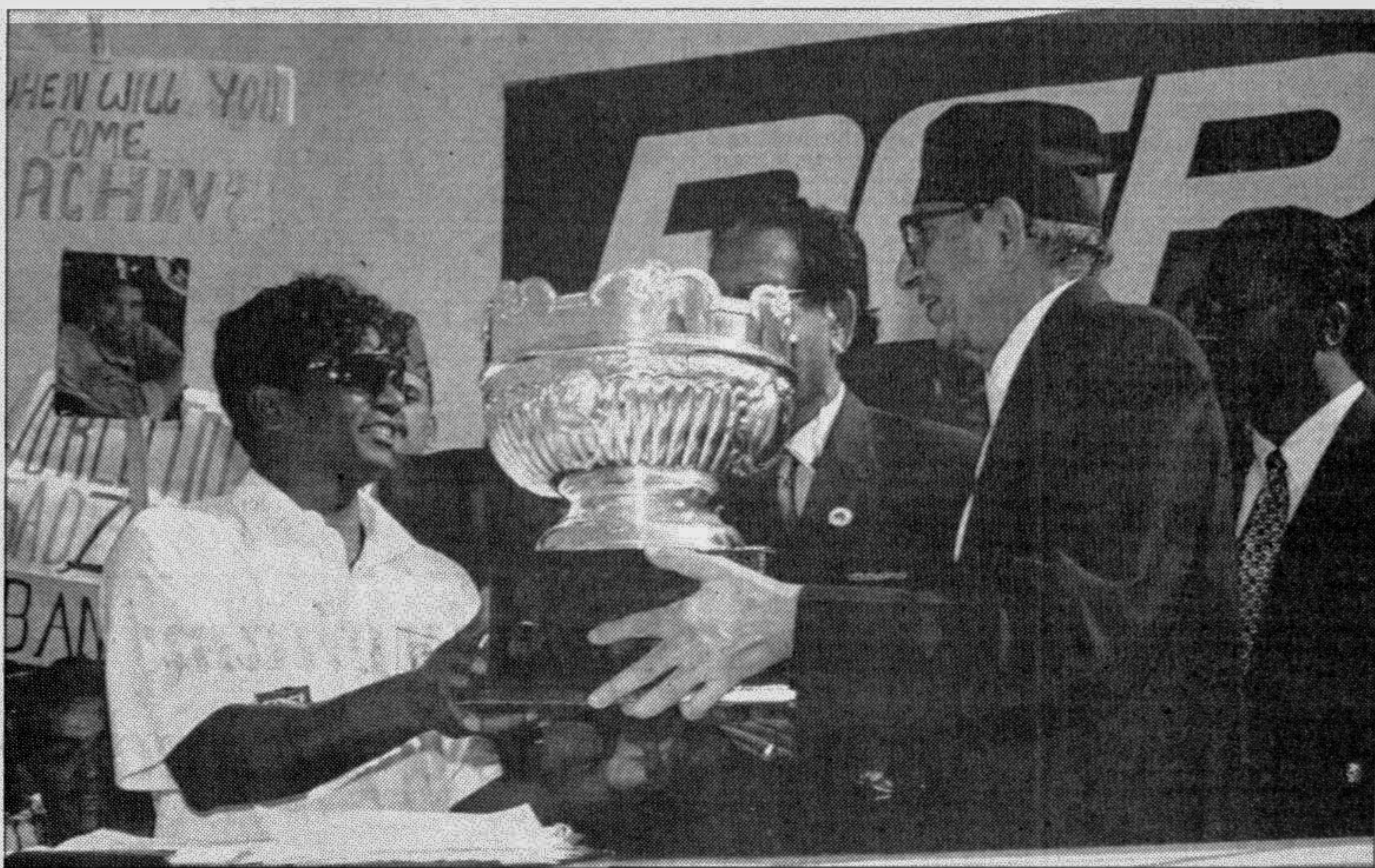
SUCCESS AT FIRST GO: Bangladesh captain Aminul Islam (L) receiving the Asian Cricket Council (ACC) Trophy from Prime Minister of Nepal Girija Prasad Koirala after the final against Malaysia in Kathmandu yesterday.

The Bangladesh team will return home tomorrow.