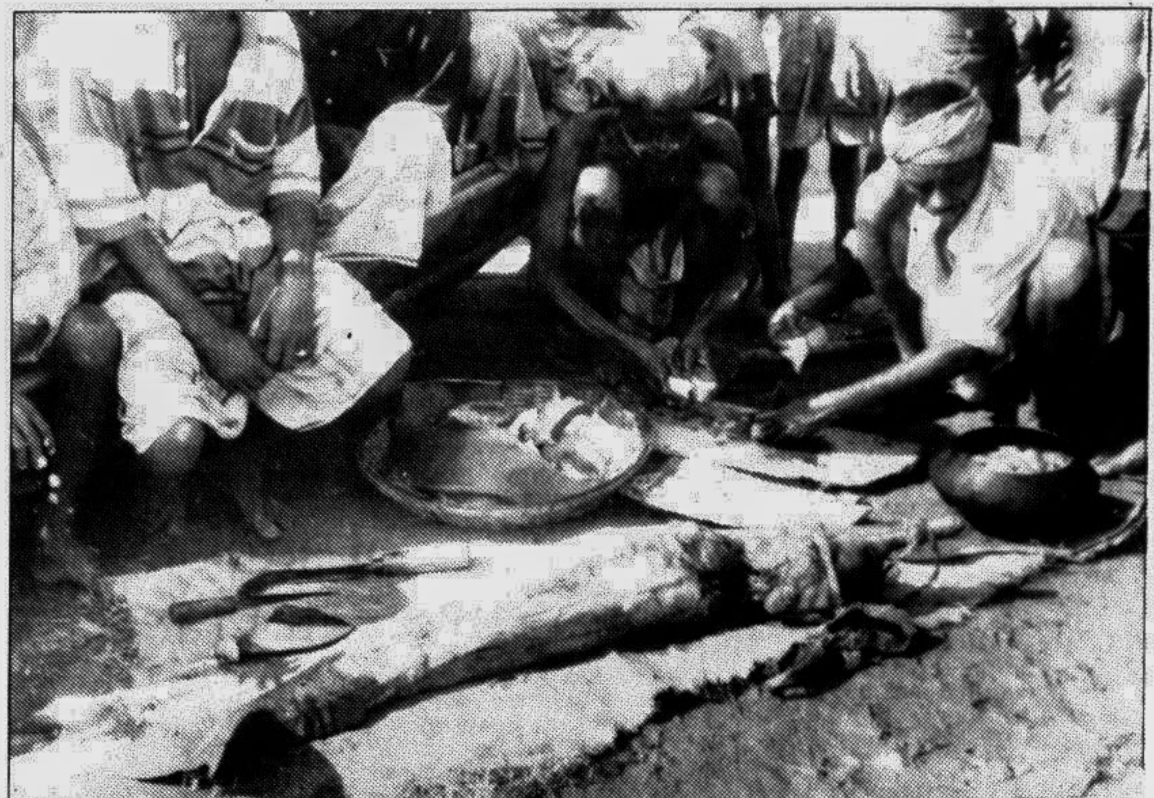
MORE THAN A POUND OF FLESH: Playful mammal, dolphin, is being butchered by lustful mammal, man.

By Morshed Ali Khan, back from Sirajganj