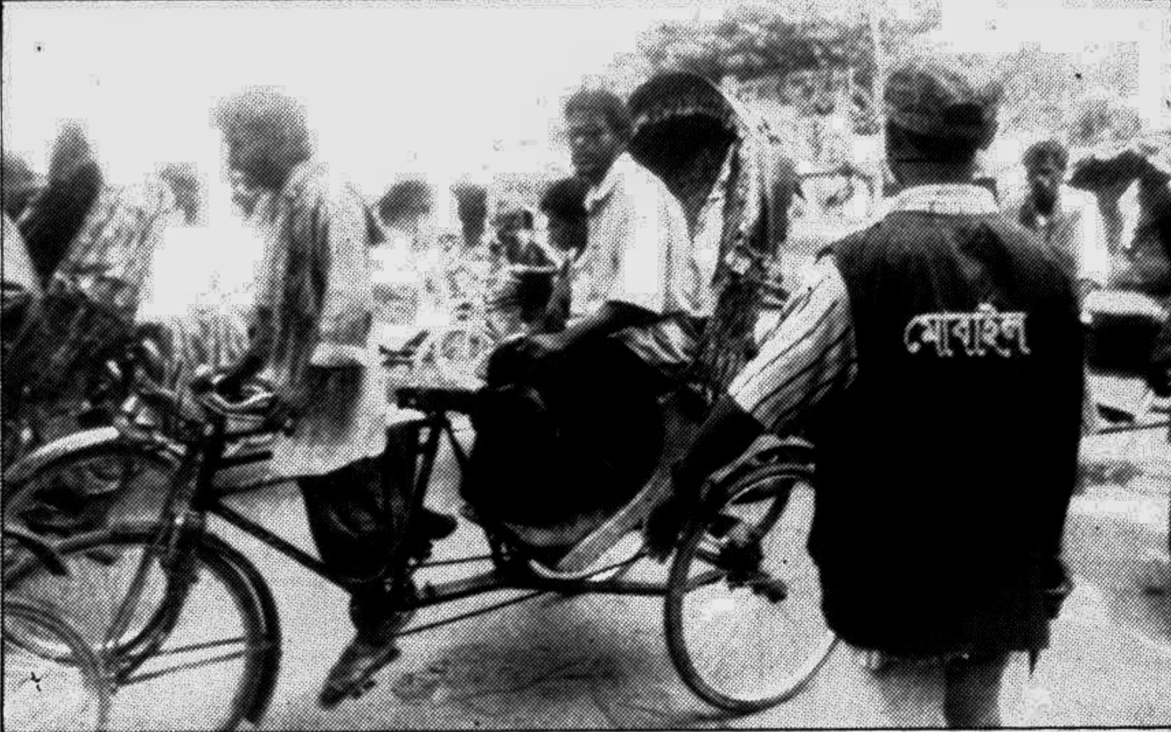
A private firm is now engaged in controlling traffic and collecting tolls from the drivers for parking vehicles in the city's Motijheel area. An employee of the firm is seen on duty.

The bodies have been sent to morgue for autopsy.