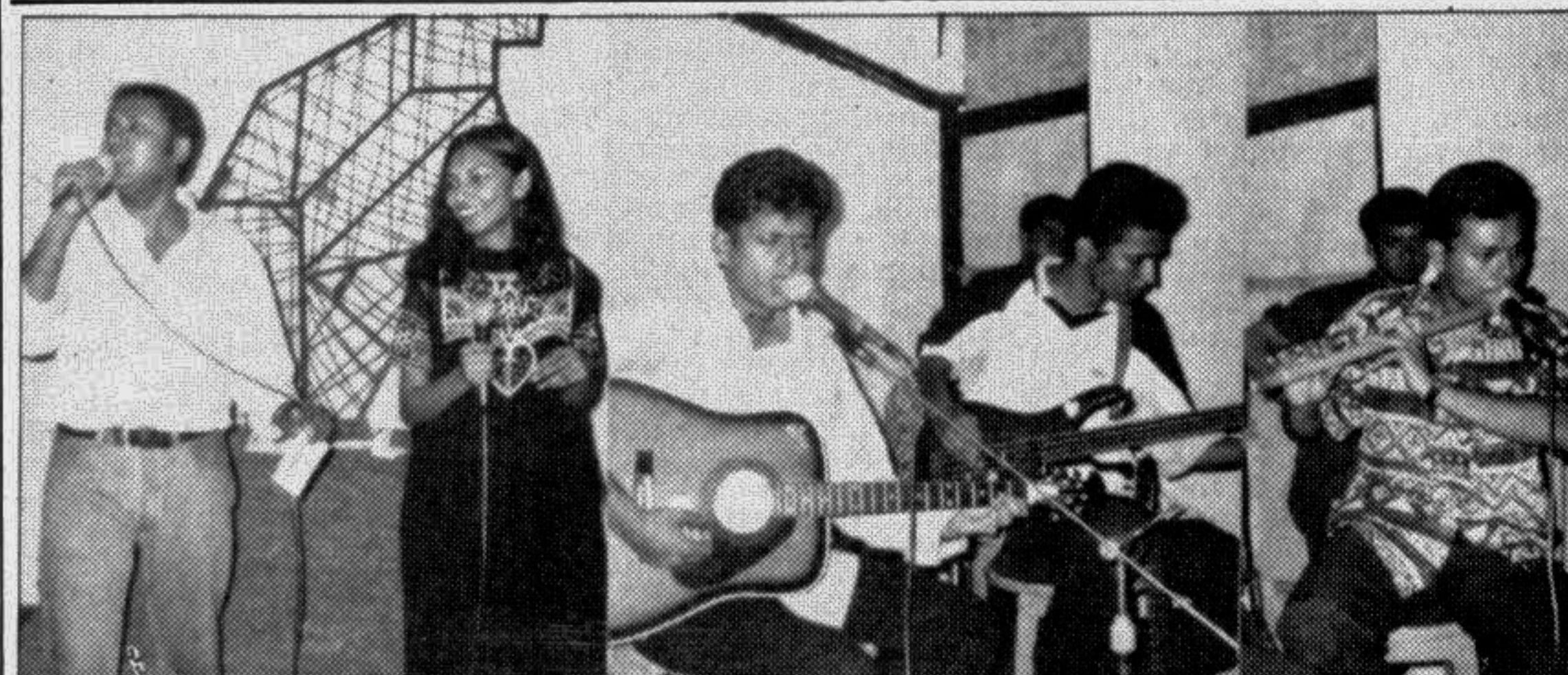
Students rendering songs at a programme organised by the Cultural Club of North South University held at NSU campus on Sunday evening. The programme included modern Bengali songs, poetry recitations and drama. The major attraction of the night was a comedy drama performed by NSU students.