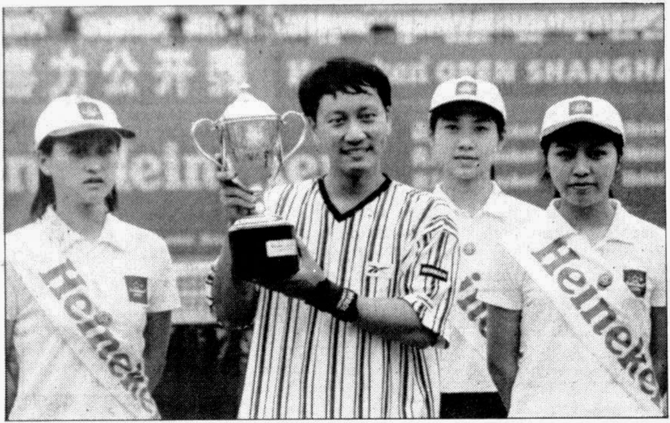
ALL SMILES: American Michael Chang, flanked by attendants, showing his Heineken Open trophy after defeating Croatia's Goran Ivanisevic in the final at Shanghai yesterday. Chang won 4-6, 6-1, 6-2.