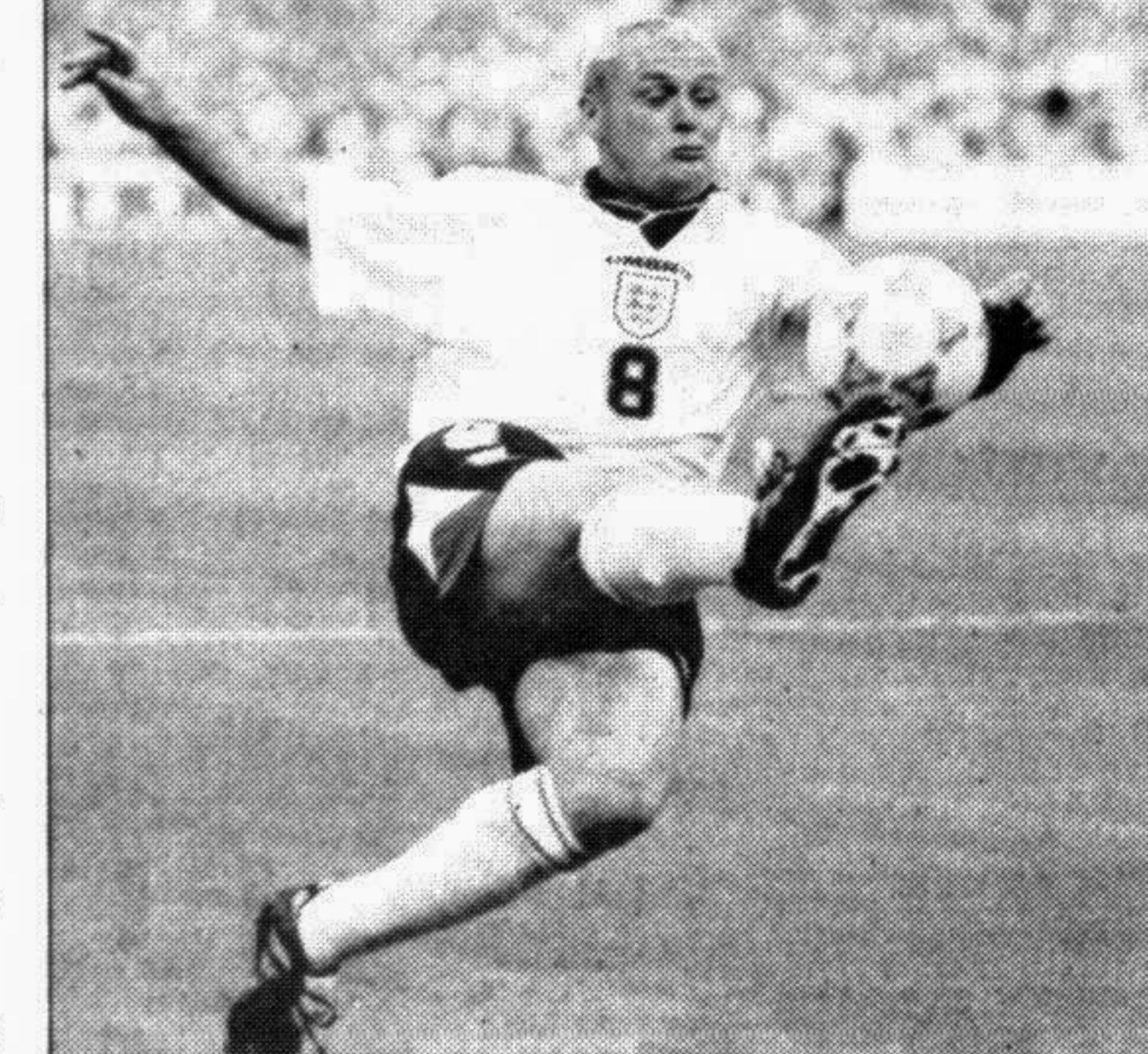
An AFP file photo of England and Middlesbrough midfielder Paul Gascoigne who had reportedly checked into a clinic due to alcohol related problems.