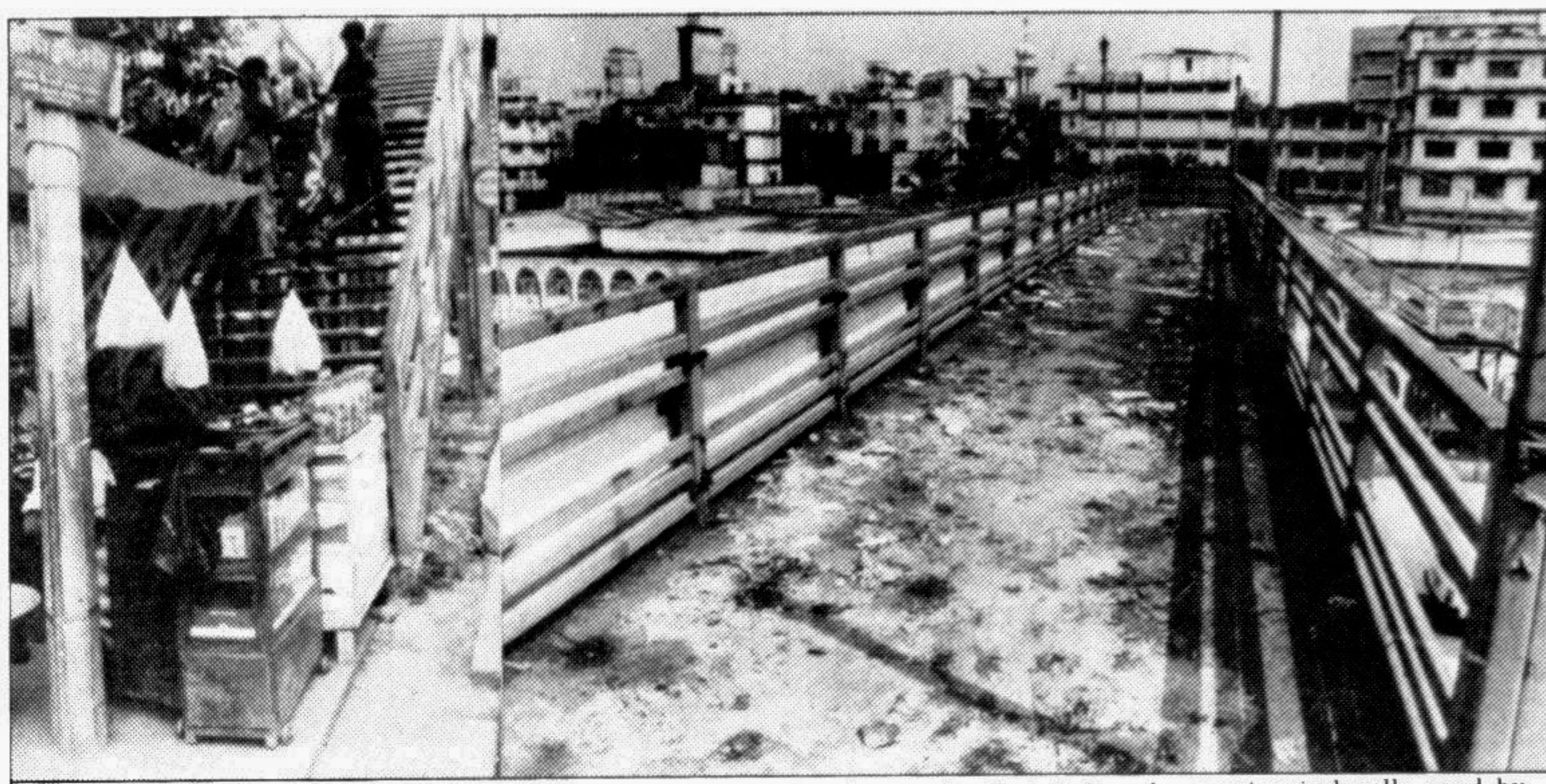
The overbridge constructed by the DCC at DIT Extension Road near the Dainik Bangla crossing is hardly used by pedestrians.

From Page 1 was selling at Tk 19 against Tk 20 to 21 15 days back and IRR at Tk 15 to 16 against its previous price of Tk 16 to 17.