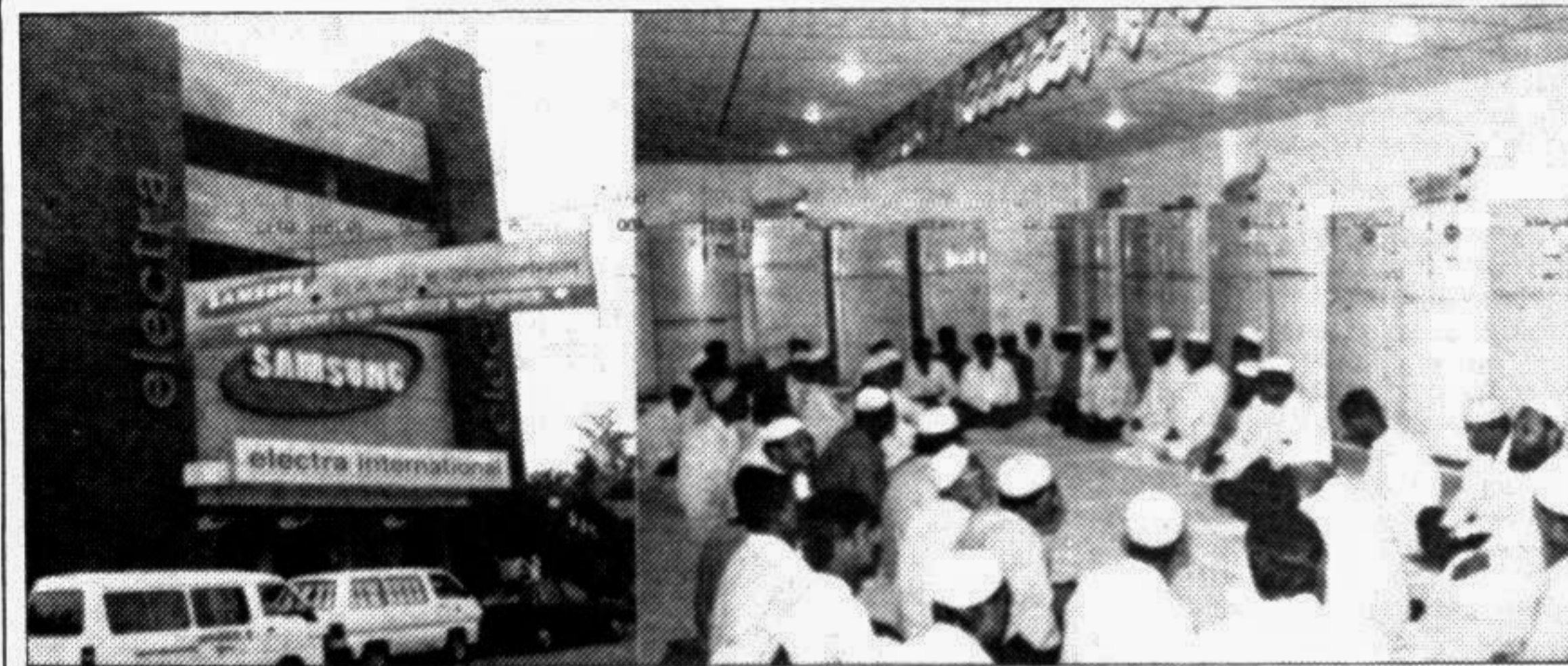
Electra International opened a sales centre-cum-showroom at the Khulna City's KDA Avenue (Gobor Chaka) recently for marketing Samsung electronics products. A milad mahfil was arranged on the occasion.