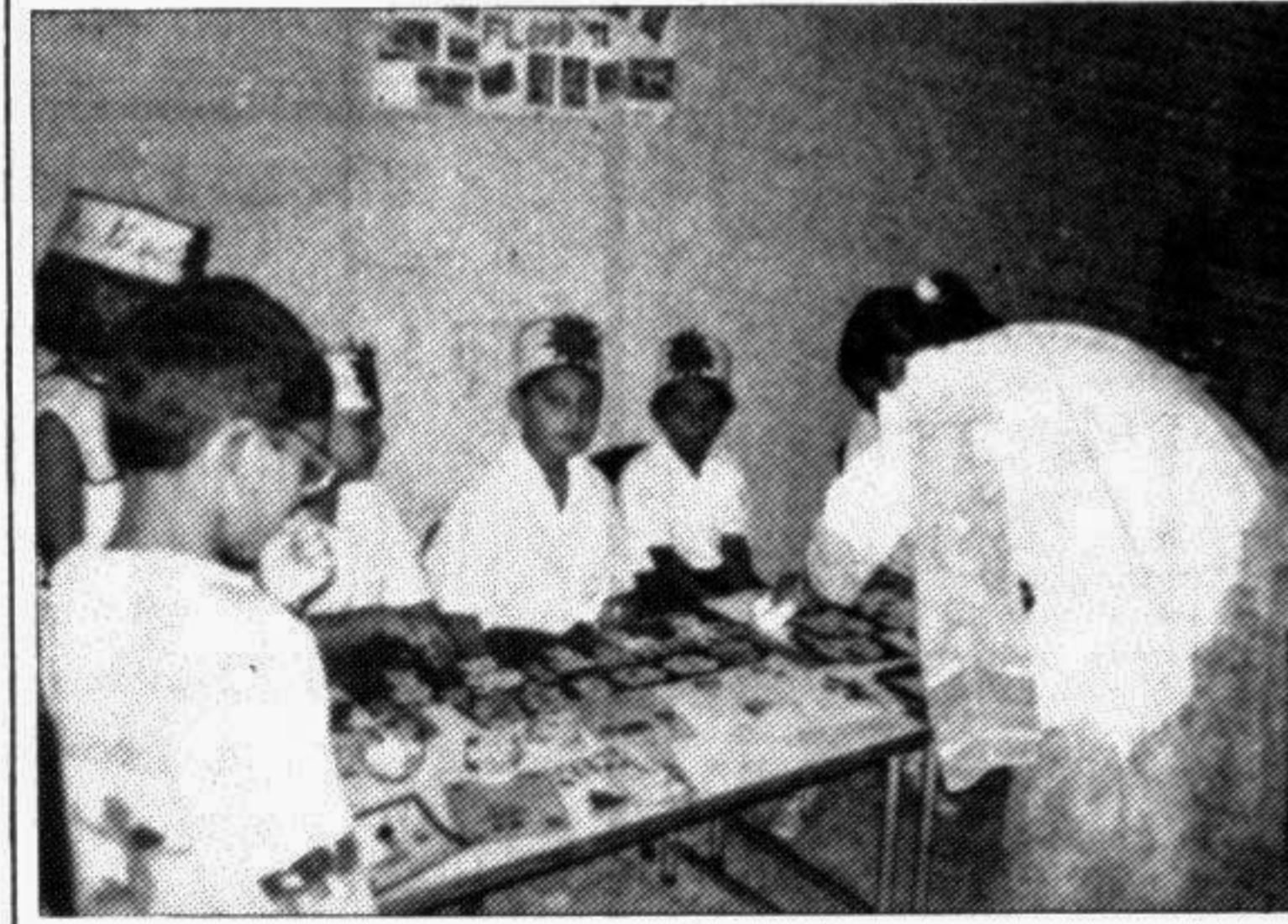
Students of Marie Curie School arranged a "Fund Raising Day" on the school premises in Dhanmondi on Saturday in aid of the flood victims. Clay pots, gift cards, jute products, masks and paper birds were on display for sale. The teachers also donated their one day's salary for the flood victims.