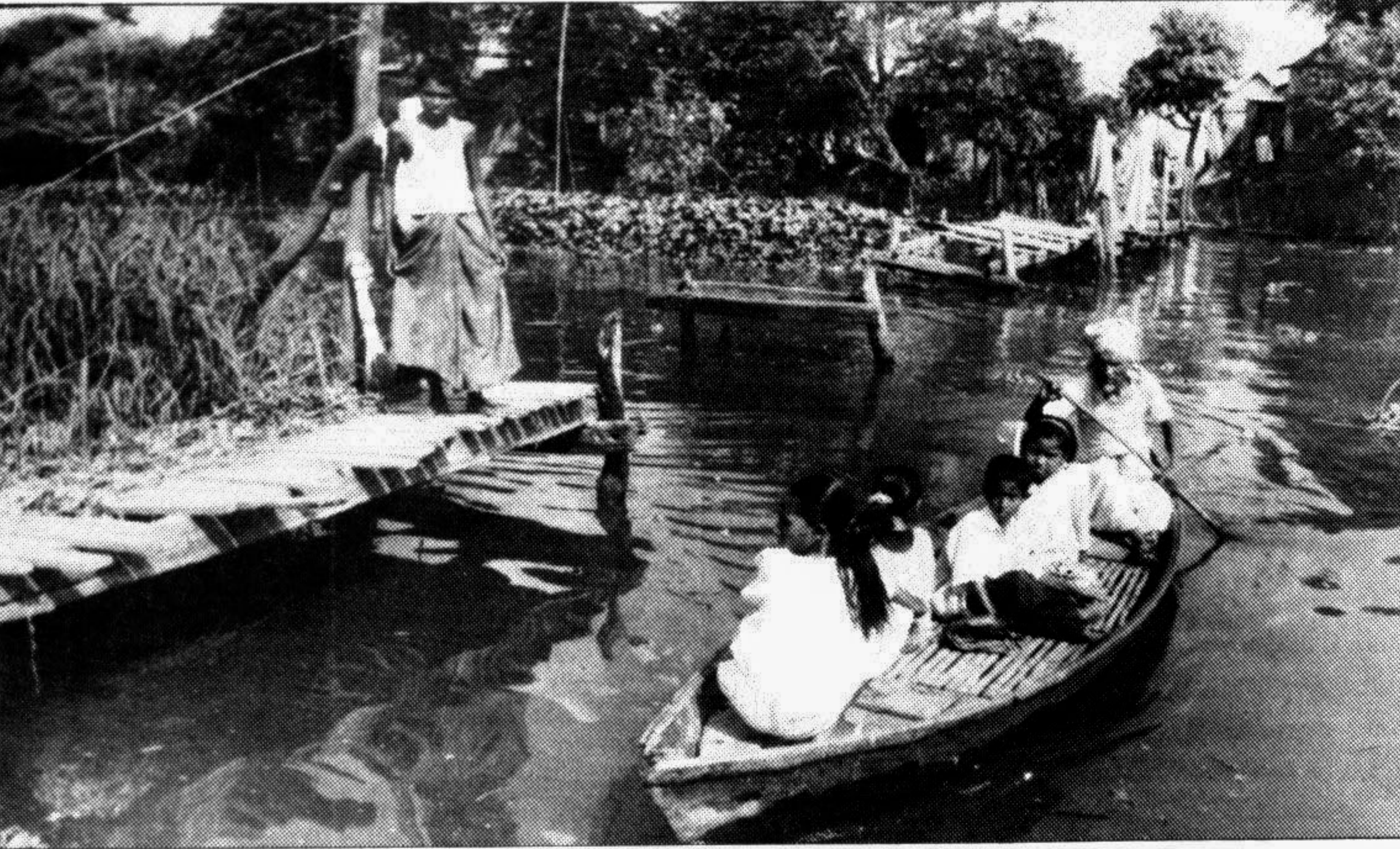
A wooden bridge at Manikdi village in Demra thana was badly damaged by flood waters recently. Now boats have become the sole mode of transport for the villagers as the bridge was their only link to Demra.

Bangladesh Garment Manufacturers and Exporters Association (BGMEA) has expressed concern over the rise of godown charges in cargo terminal by Biman authorities, reports UNB. BGMEA president Mostafa Golam Quddus in a statement yesterday said the unilateral decision of the authorities to raise godown charges by 80 per cent is unfortunate and it will affect the import of fabrics and garment accessories. He said the authorities' decision came at a time when the industry is passing through a critical time following the country's devastating flood.