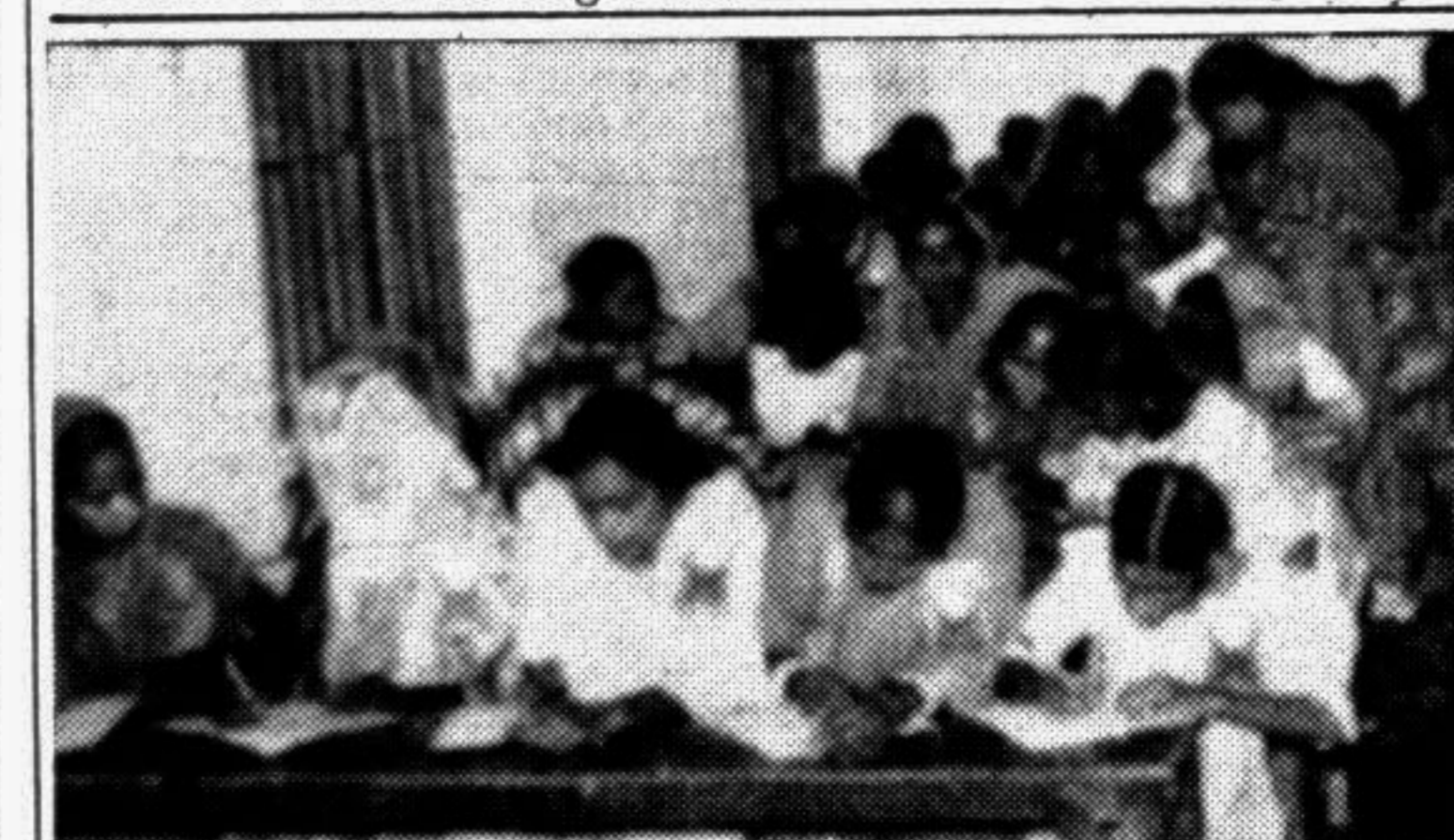
MAGURA: Magura district has been freed from the curse of illiteracy. This is because of success of Total Literacy Movement recently. Photo shows a group of women appearing at the final examination of the movement under Bikoshito Magura.