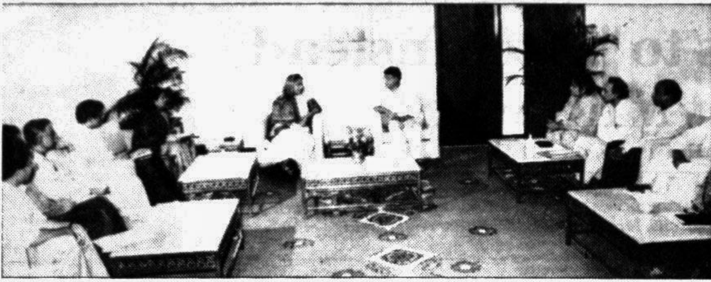
An ADAB delegation called on Prime Minister Sheikh Hasina at the International Conference Centre yesterday.