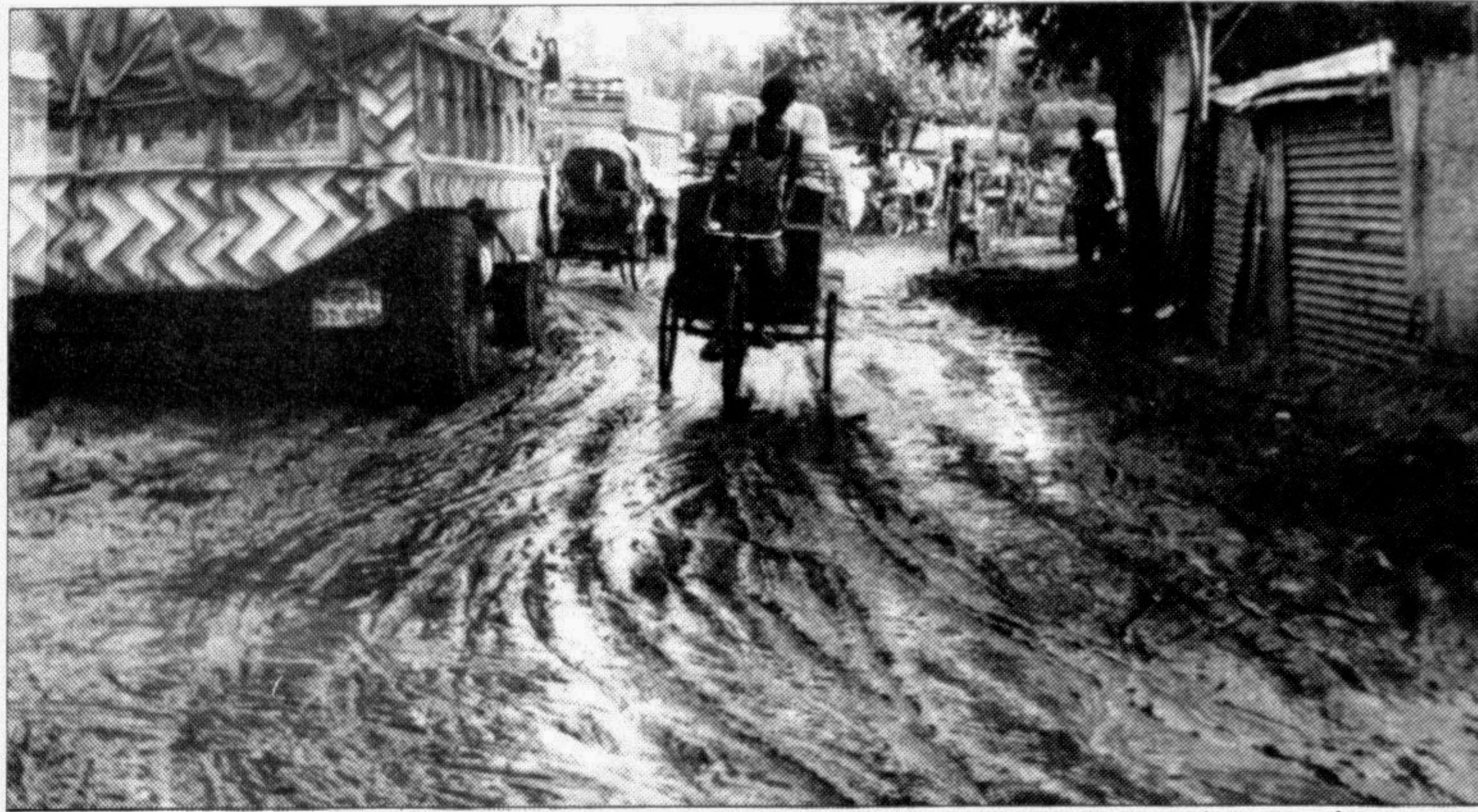
Tejgaon Railway Station Road has been in bad shape for a long time, causing immense suffering to the passers-by.