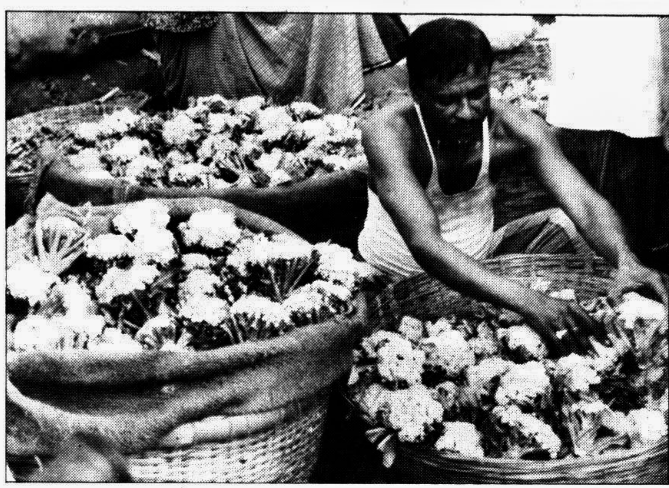
Cauliflower, a winter vegetable, has already started arriving in city markets.