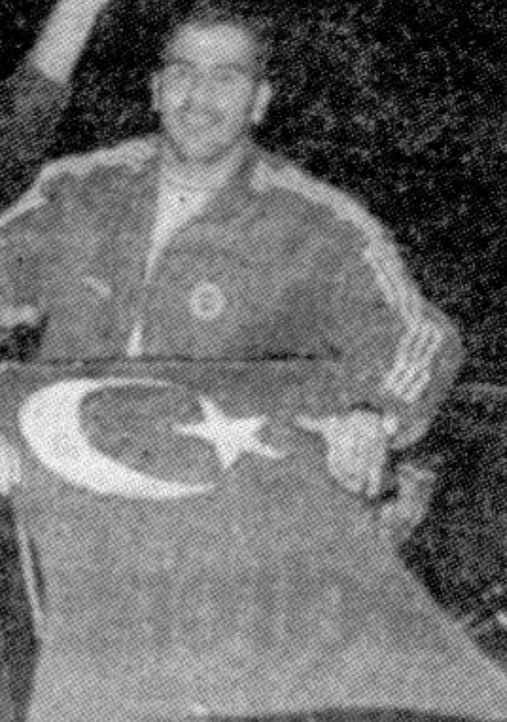
TURKS GO WILD: Turkish expatriates take to the streets of Berlin in celebration of their country's astonishing triumph over mighty Germany in a European Championship qualifying game on October 10.

The first half was dominated by a midfield duel with both sides seemingly reluctant to take any chances and risk defeat.