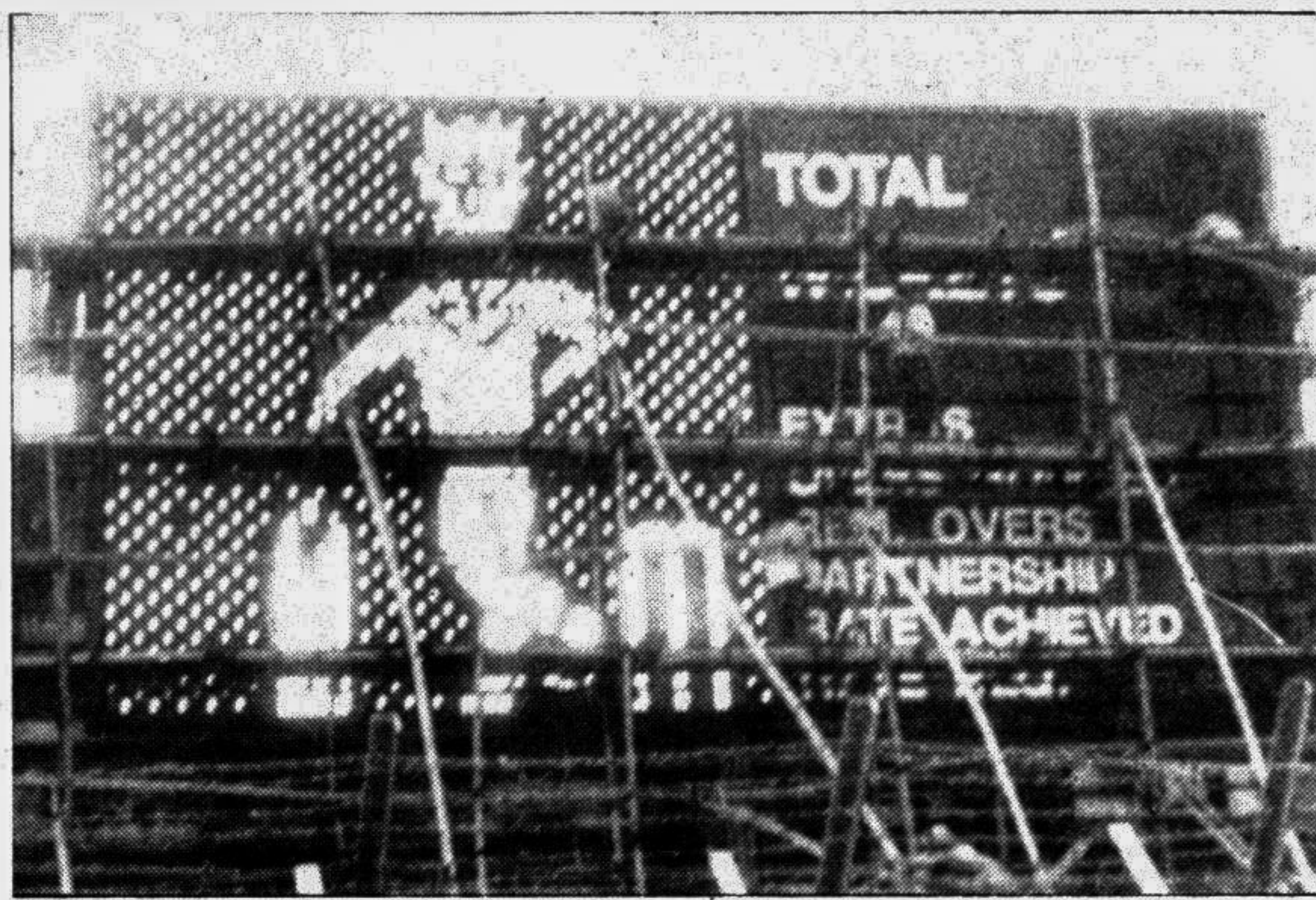
READY TO ROLL: The electronic scoreboard at the Bangabandhu National Stadium was switched on for the first time by its manufacturing technicians from Display Solutions Incorporated yesterday.

Nakib's header entered into the Brothers net in the 72nd minute off a lob of Nazrul Babu (3-0).