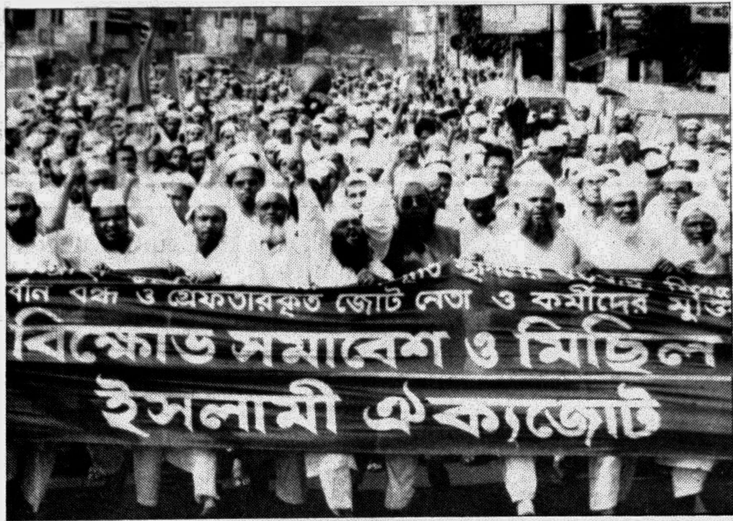
Islami Oikya Jote brought out a procession in the city yesterday demanding release of its leaders and activists.