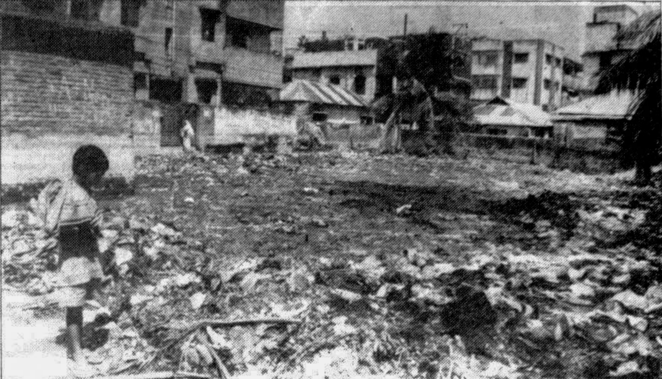
Although flood waters have receded, piles of garbage have remained strewn at Kadamtala in the city's Basabo area, causing immense suffering to the local residents.

The president of parliament controls legislative sessions and becomes acting head of state when the king is outside the country.