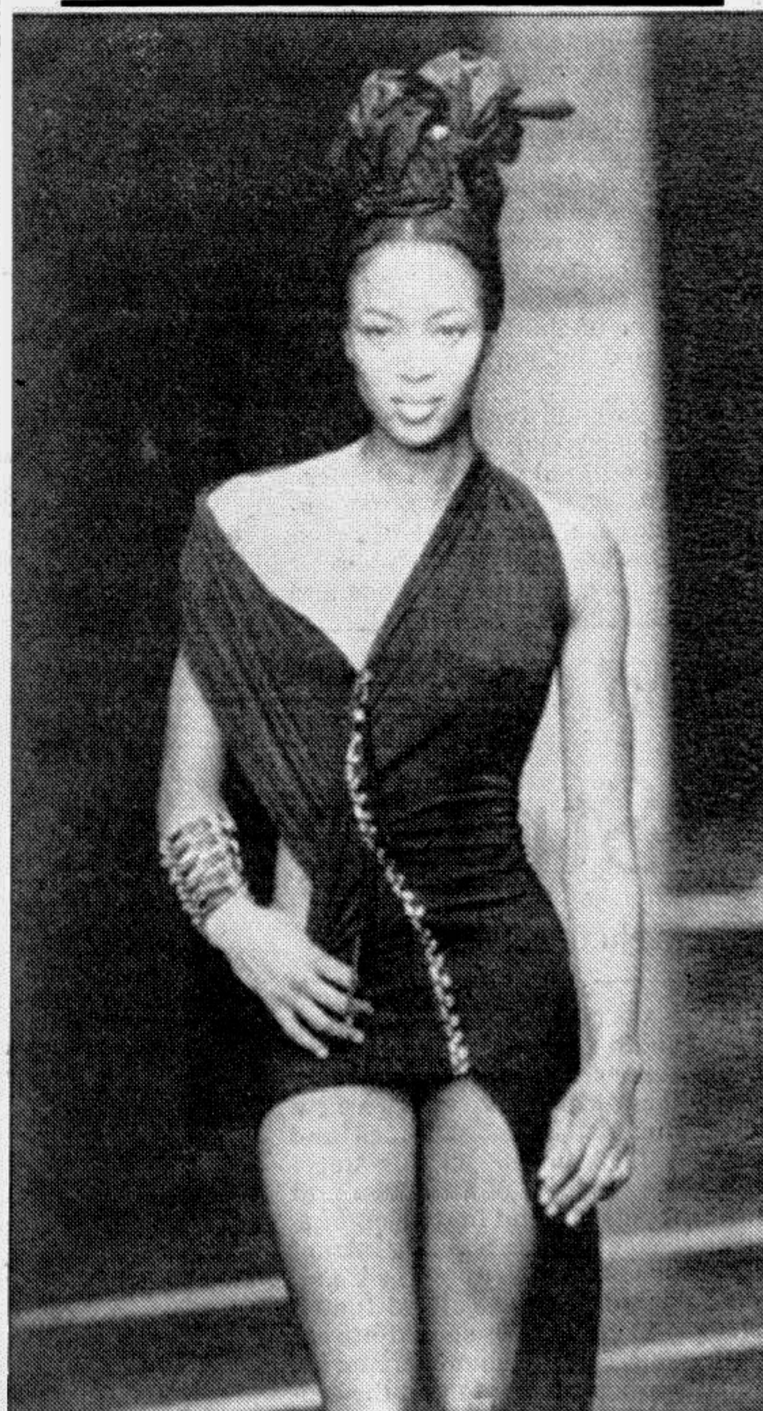
British supermodel Naomi Campbell features a Caribbean style scarf and a revealing black dress at the Gianfranco Ferré Spring/Summer collection presented in Milan on Thursday.