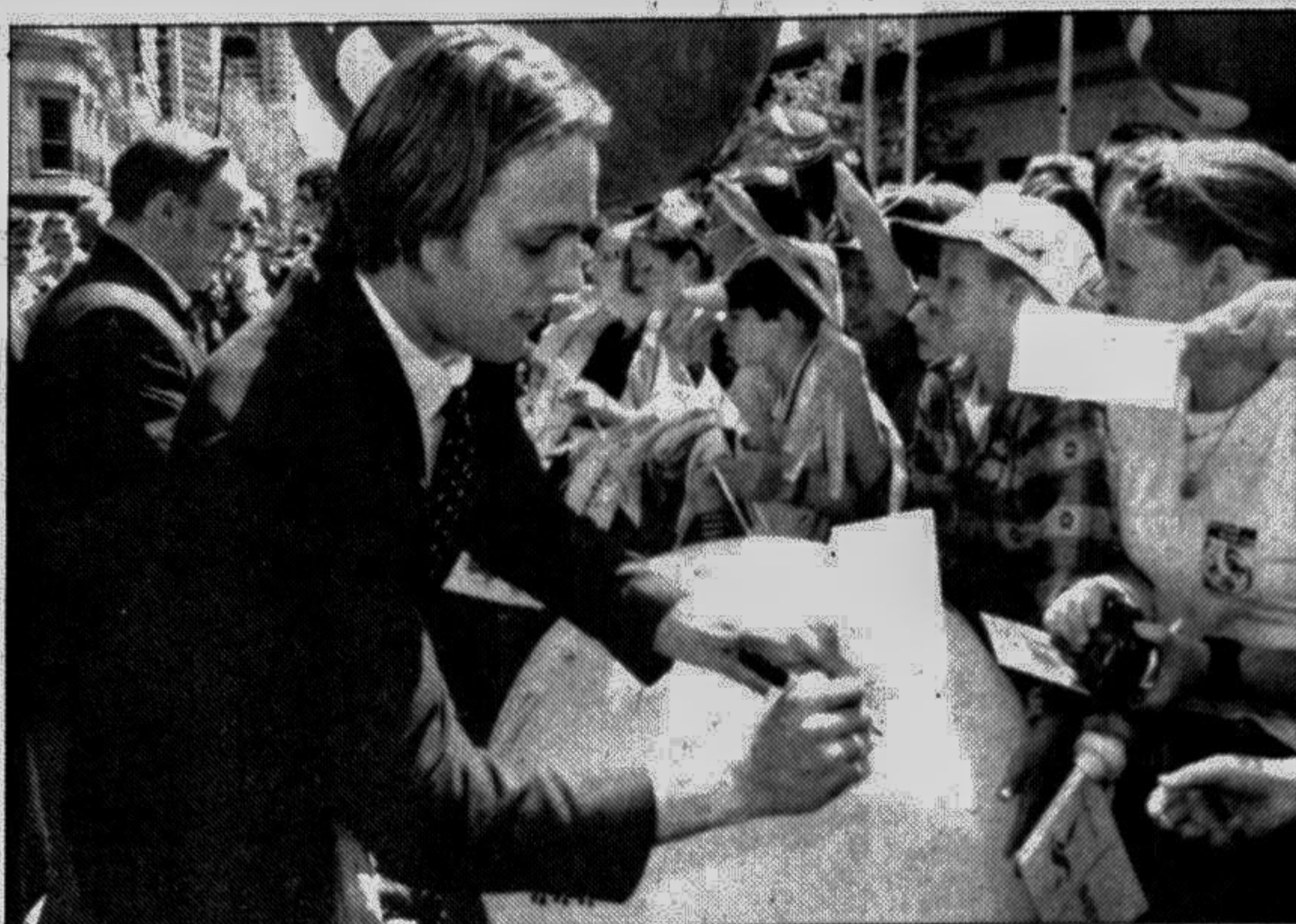
Sprinter Matt Shirvington signing autographs for fans in Sydney during a welcome home parade for the Australian Commonwealth Games delegation yesterday.

Samir, who played for Iraq in the 1986 World Cup, will take over the charge of the national