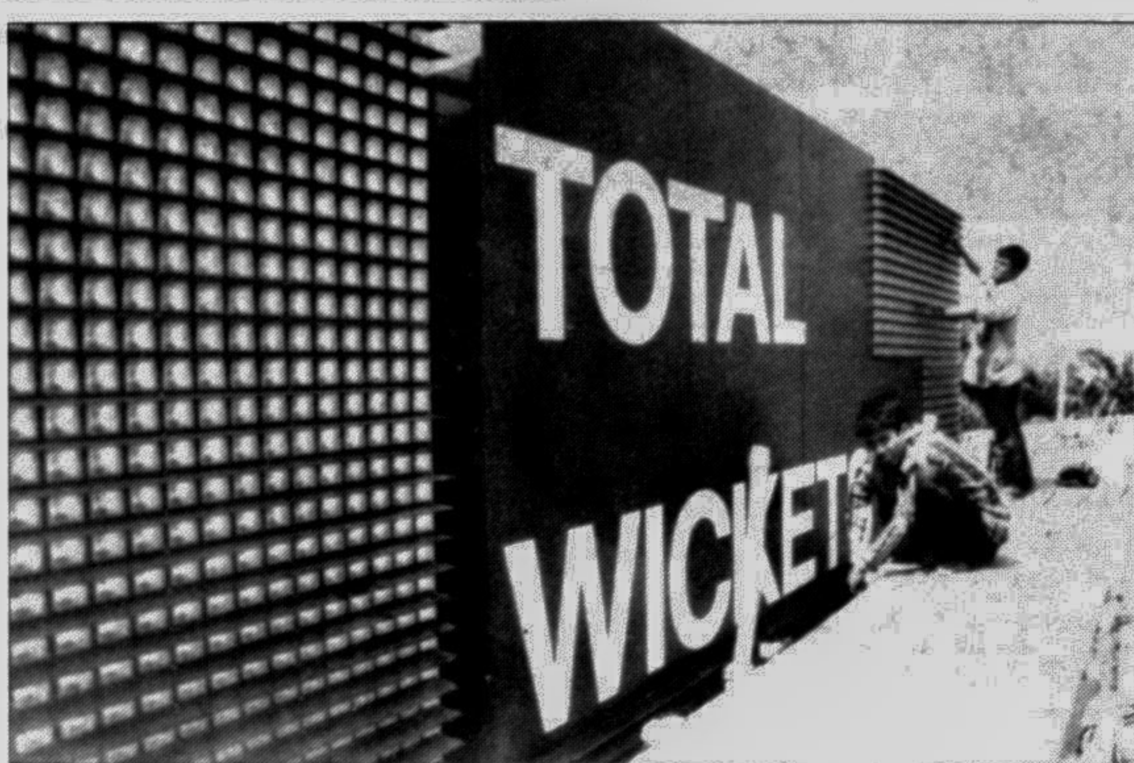
The 30 million-taka electronic scoreboard is in the final stages of erection at the Bangabandhu Stadium. The formal inauguration will be held on 12 October.