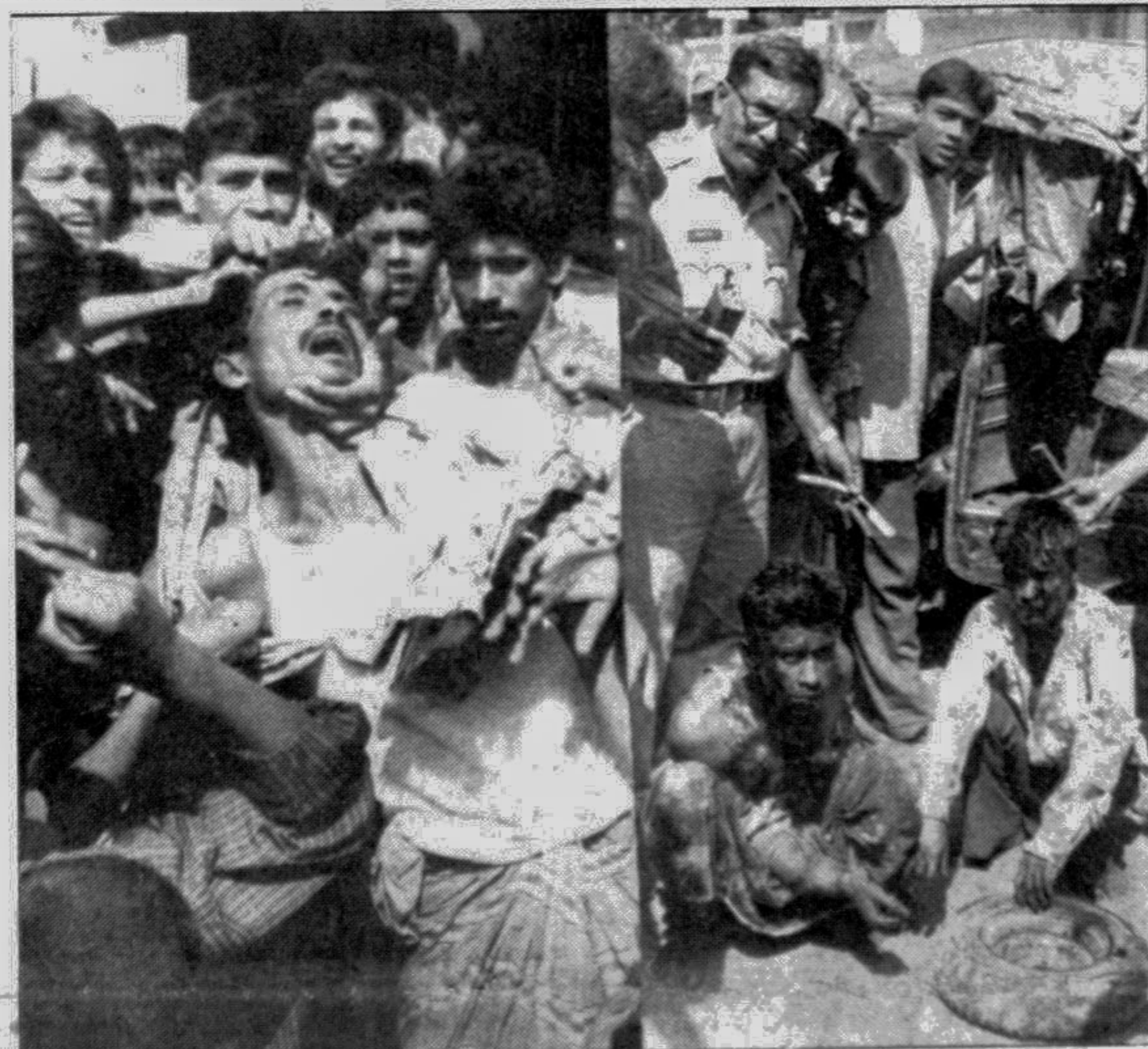
FACING THE MUSIC: A mugger being beaten up in the city's Kamalapur rail station yesterday and (right) two snatchers, caught at Wari, under police custody.

Shell-Cairn (block 5) UNOCAL-Triton (block 7) and Pangaea-OMV (block 8). OMV was not a bidder in the second round but included later by US company Pangaea following a government suggestion. However, in a recent development, OMV declined to participate in the bidding unless another block is awarded to it. This may lead to a deadlock in block-8 negotiations, sources said. The government had also sent a letter to Tullow Oil asking the company to be ready for partnership negotiations with See Page 12 Col 5