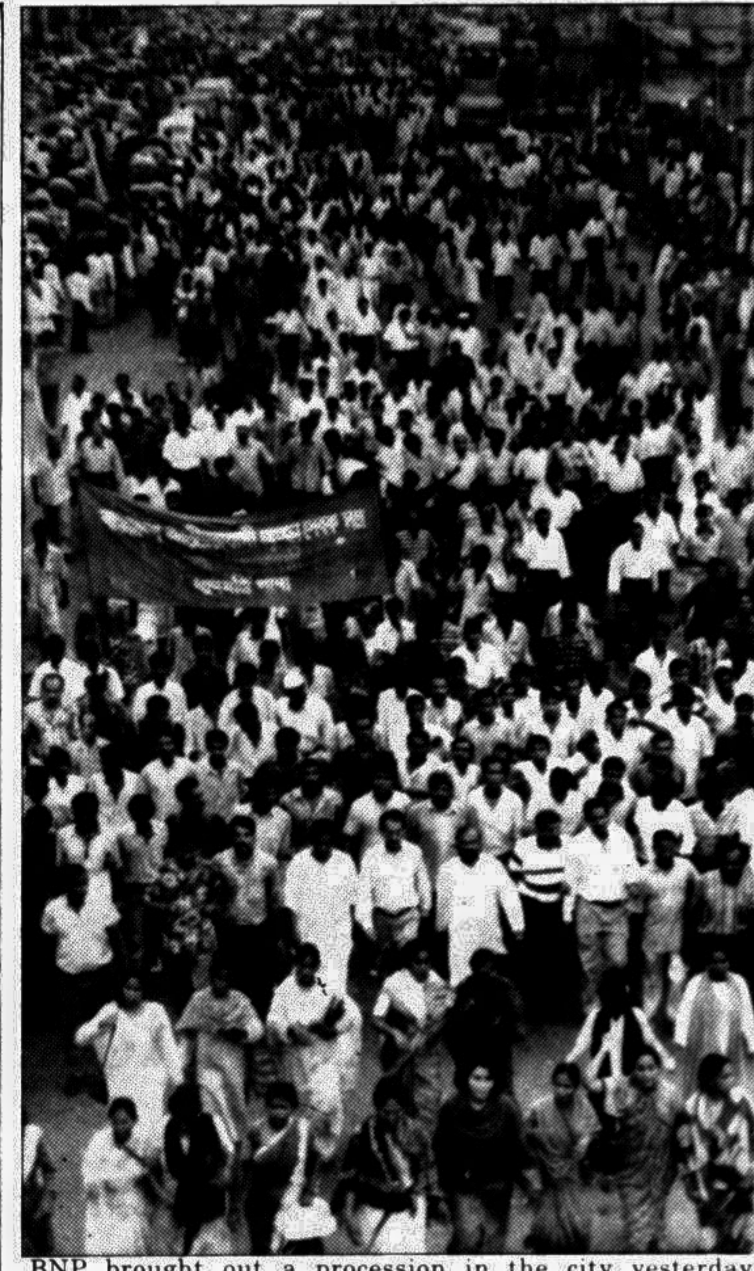
BNP brought out a procession in the city yesterday demanding release of three leaders arrested in connection with the jail killing.

On September 16, IFIC again wrote to the central bank, which closed the chapter by saying "There is no scope to reconsider your proposal".