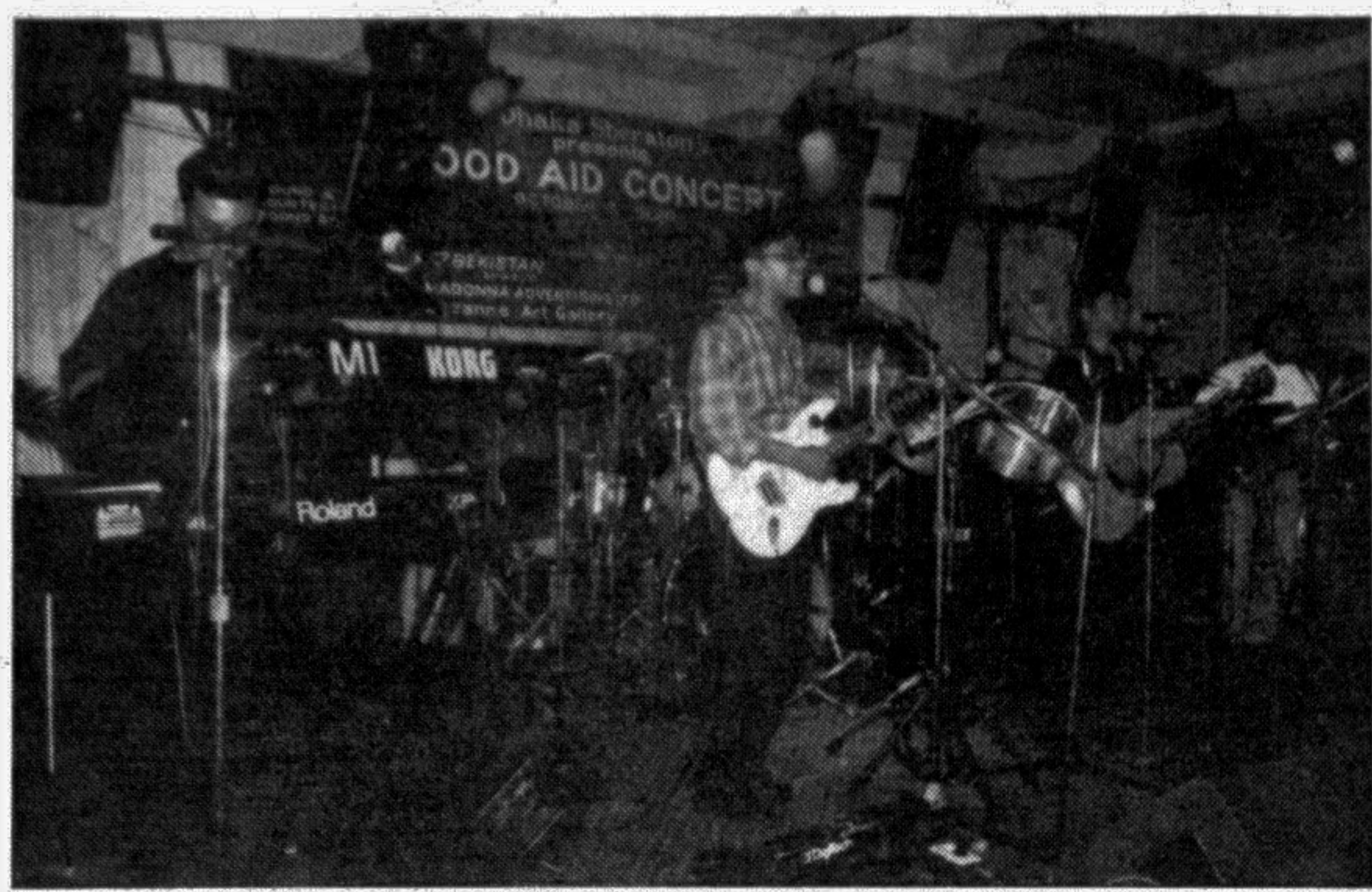
A band performing at a concert in aid of flood victims held at Dhaka Sheraton Hotel yesterday.