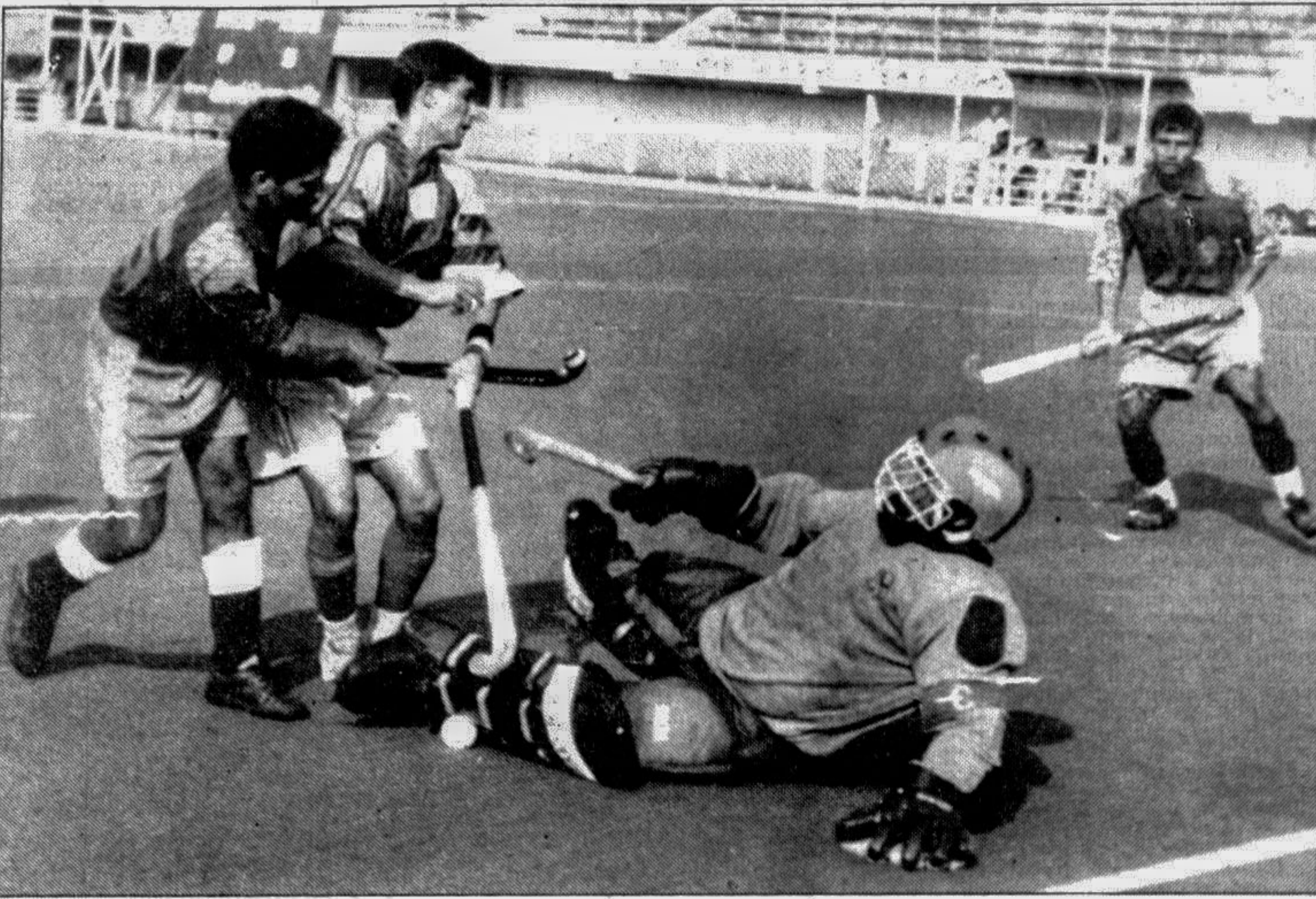
A goal mouth action from yesterday's Green Delta First Division Hockey league encounter between Bangladesh Railway and Cantonian Sporting at the Maulana Bhashani Stadium yesterday.