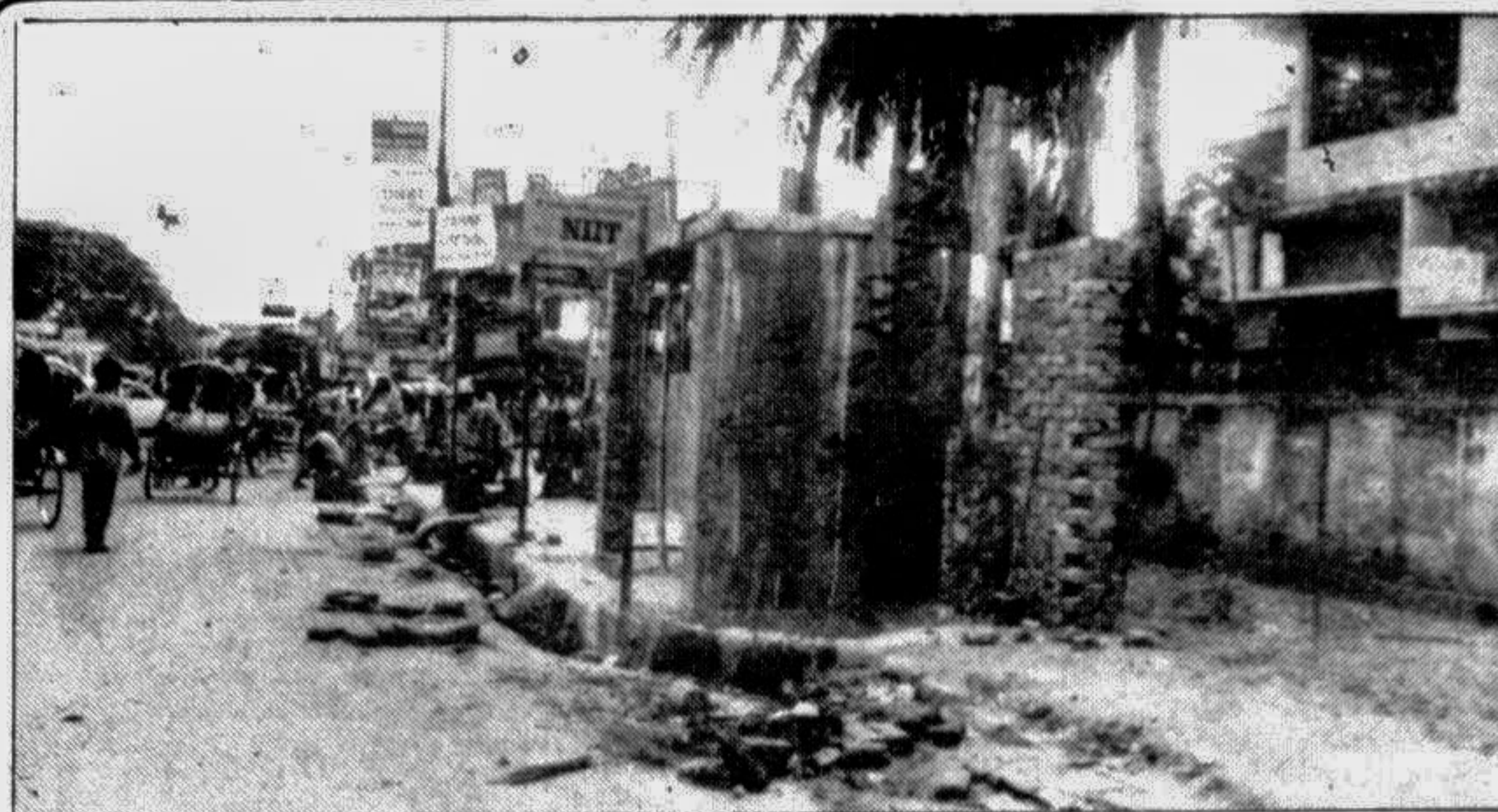
LET'S CARE A DAMN: Structures are being built on a pavement on Satmasjid Road in the city's Dhanmondi area allegedly without having any permission from the relevant authorities.

Published by the Editor from City Publishing House Ltd., 90 Kakrail, Dhaka-1000 on behalf of Mediaworld Ltd., 52 Motijheel C.A., Dhaka-1000. Editorial, News & Commercial Offices: House No. 11, Road No. 3, Dhanmandi RA, Dhaka-1205. PABX: 866772-4, Commercial: 866771, Fax No: 88-02-863035, GPO Box No: 3257, Cable: DAILYSTAR, DHAKA. Internet edition address: http://www.dailystarnews.com and Email address: datar@bangla.net