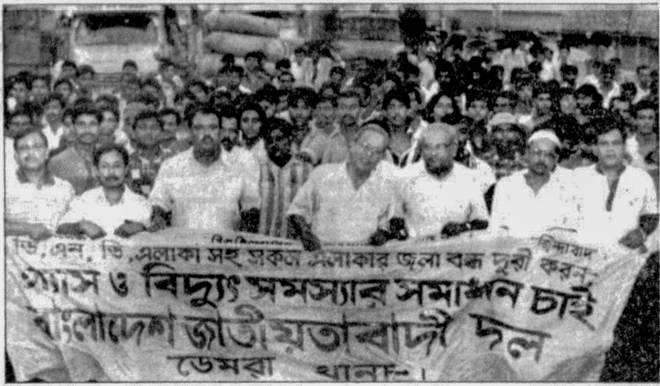
Demra thana unit of BNP brought out a procession in the area yesterday demanding smooth supply of gas and electricity. Dr AQM Badruddoza Chowdhury, Deputy Leader of the Opposition in Parliament, among others, led the procession.

He said there was no need to reform the administration if the existing laws, rules and regulations can be implemented effectively. "Nearly 80 per cent problems can be resolved by the existing laws," he observed. About the discretionary power, he said the more the power would be exercised, the more the people would have to bear the affliction. He said an international seminar on public administration is expected to be held in Dhaka on March, 1999. Hasanul Haq Inu said, "It's a matter of political decision to ensure transparency, efficiency and accountability." He said size of the government will have to be downsized and the bureaucracy will be limited at the Joint Secretary level. "During the last 10 years, size of the cadre service has been expanded by at least 10 times," he added. Inu said each and every ministry should have an expert cell which could be formed by hiring people on a contract basis. The speakers also stressed the need for strengthening parliamentary committees to ensure accountability and suggested formation of a professional cell for each of the committees.