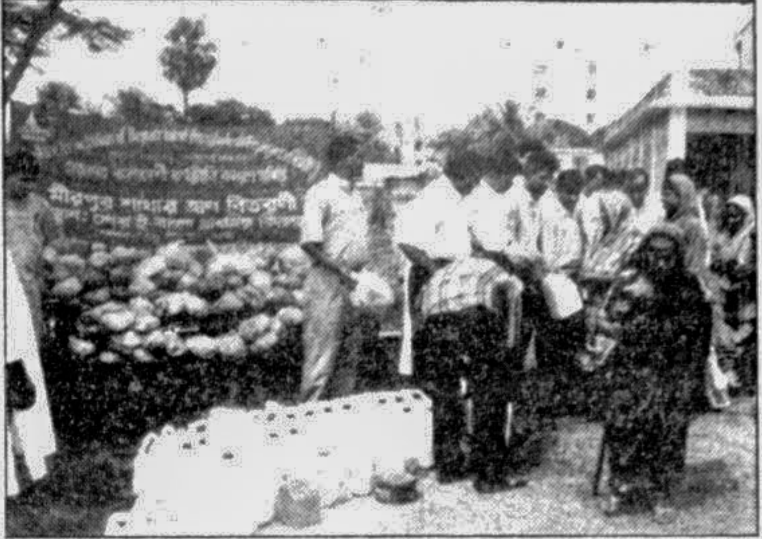
Mirpur thana unit of Welfare Association of Repatriated Bangladeshis Employers distributed relief materials at the flood shelter at Sher-e-Bangla Primary School in Mirpur recently.