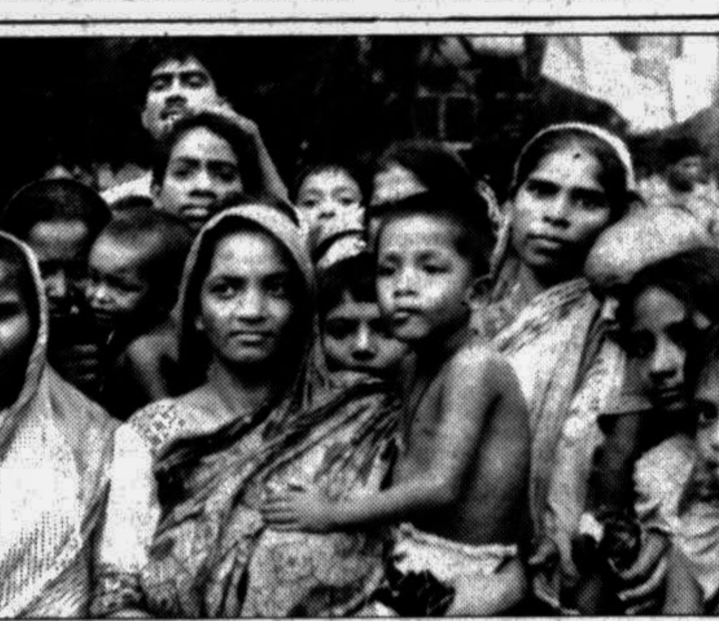
Flood-affected people of Ward No 29 of Dhaka City Corporation gathered in front of the Jatiya Press Club on Sunday to complain against the ward commissioner as they were not being provided with adequate relief materials.

Bhuiyan said the government arrested them to divert public attention from its failure in running the country and tackle the post-flood situation.