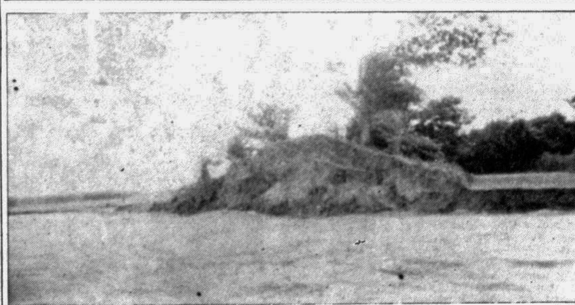
BARISAL: Erosion of the river Meghna is going on unabated in Hizla thana area of the district.

About 300 metric tons of fish from 939 ponds have been washed away by the flood.