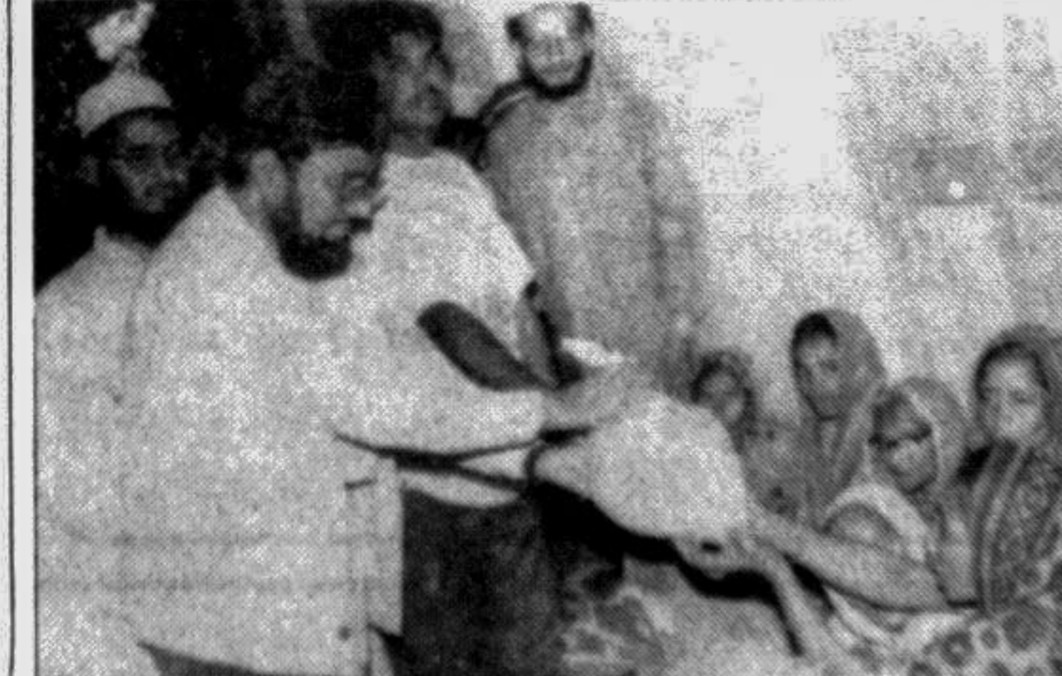
NATORE: The Deputy Director of Islamic Foundation, Natore distributing relief goods among the flood stricken people of Lalpur thana.