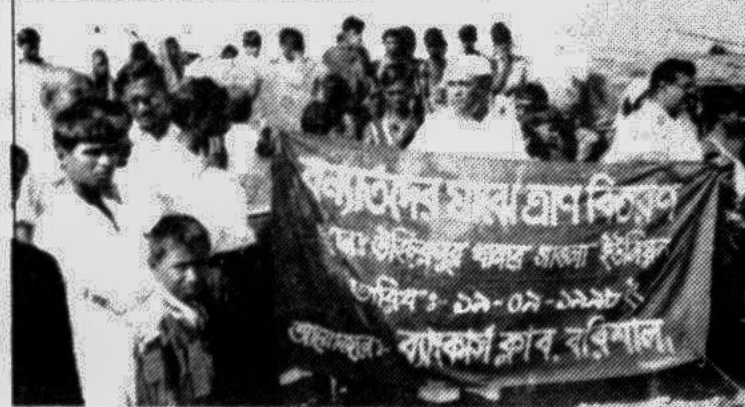
BARISAL: Bankers' Club of Barisal recently distributed relief materials among the flood affected people of Satra union in Uzirpur thana.