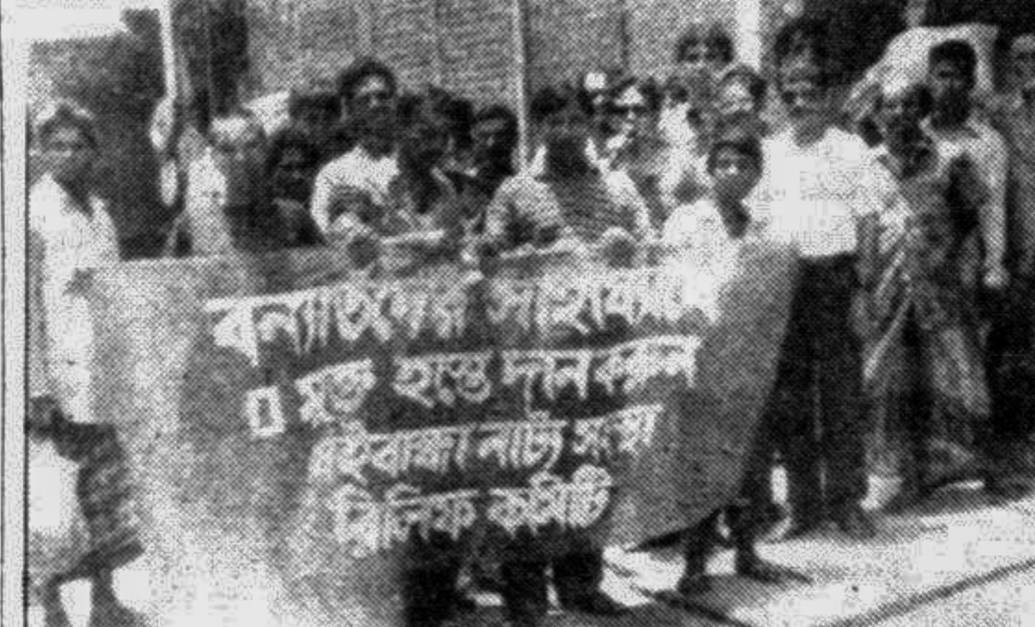
GAIBANDHA: The members of Gaibandha Dramatic Club collecting donations for the flood victims of the district.