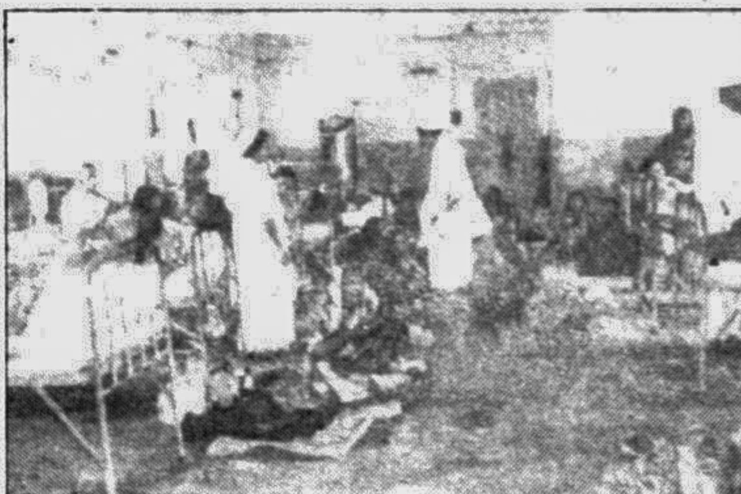
JHENIDAH: Many patients are seen flooring at Shaikupa Thana Health Complex for want of beds.

As a result hospital was compelled to arrange flooring facilities for the patients.