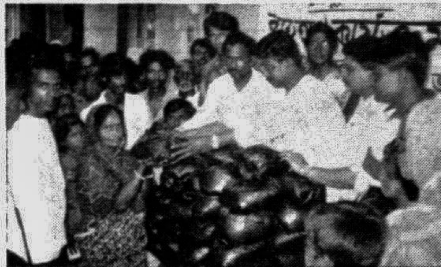
CHANDPUR: Bangladesh Red Crescent Society, Chandpur unit distributing relief goods among the flood victims of Purnabazar.

According to Public Health Engineering Department, 8,591 tubewells were damaged by flood in 10 thanas of the district. A total of 839 tubewells were damaged completely and 7,752 tubewells partially. The repairing work of tubewells damaged partially is going on.