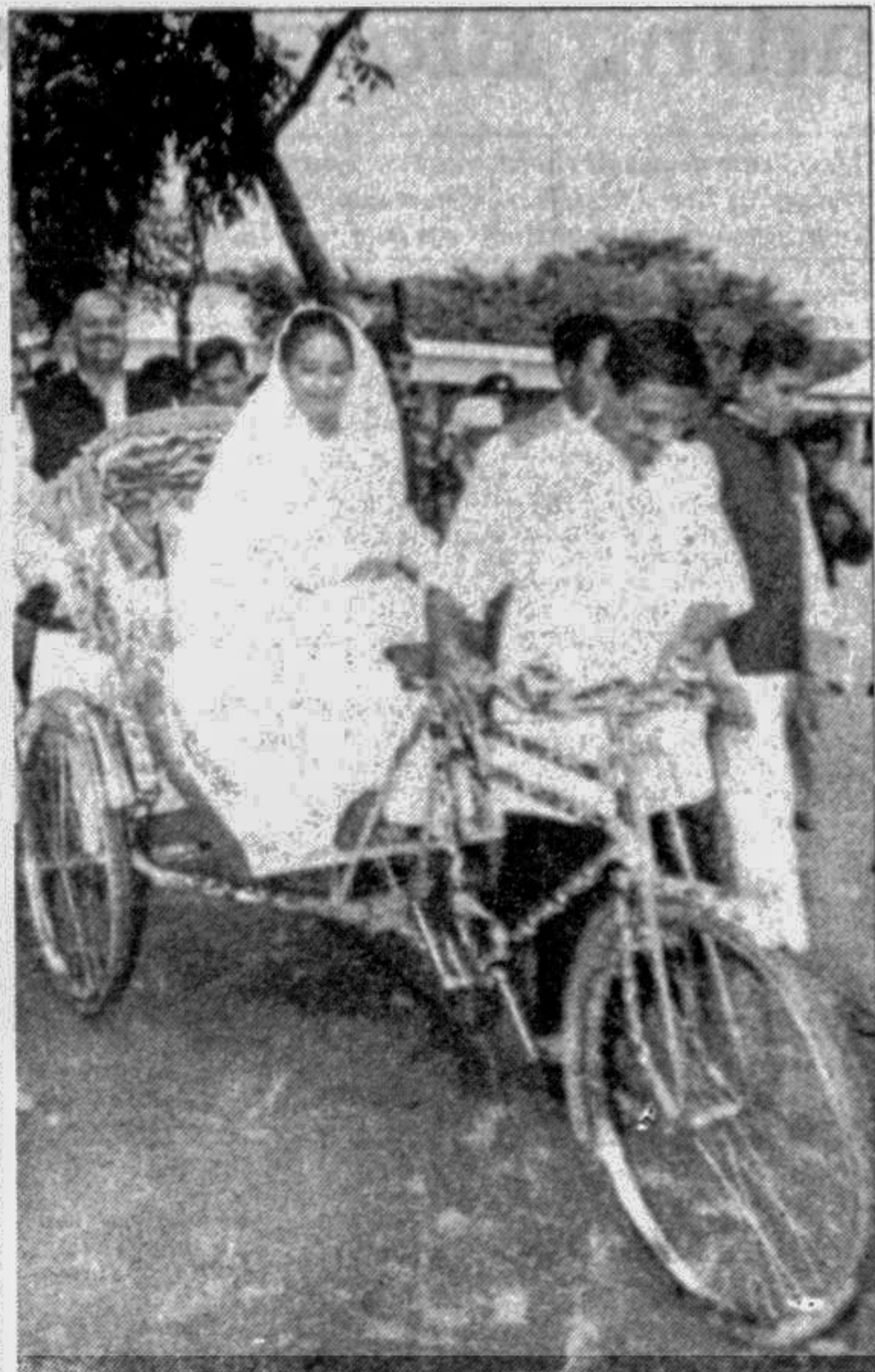
Prime Minister Sheikh Hasina going by a rickshaw to Mithamon haor area in Kishoreganj to distribute relief materials yesterday.

Club meeting: The weekly meeting of Rotary Club of Greater Dhaka will be held. Venue: Officers Club, Baily Road. Time: 5:30 pm.