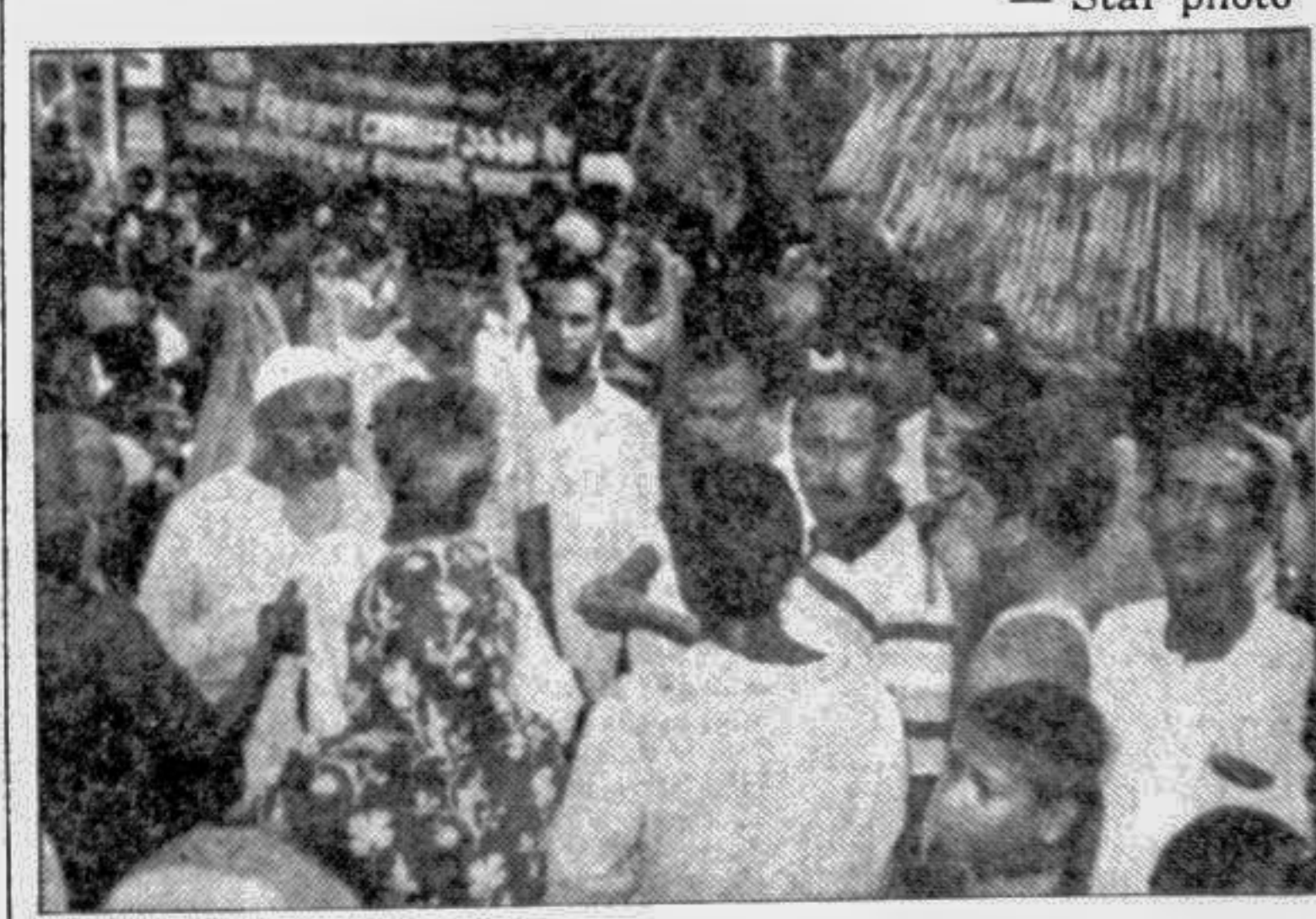
MUNSHINGANJ: Shapla Jubo Sangha, a local youth organisation, in collaboration with Almarkajul Islami, Bangladesh recently distributed relief goods among the flood affected people of Mahakali union in Munshiganj.