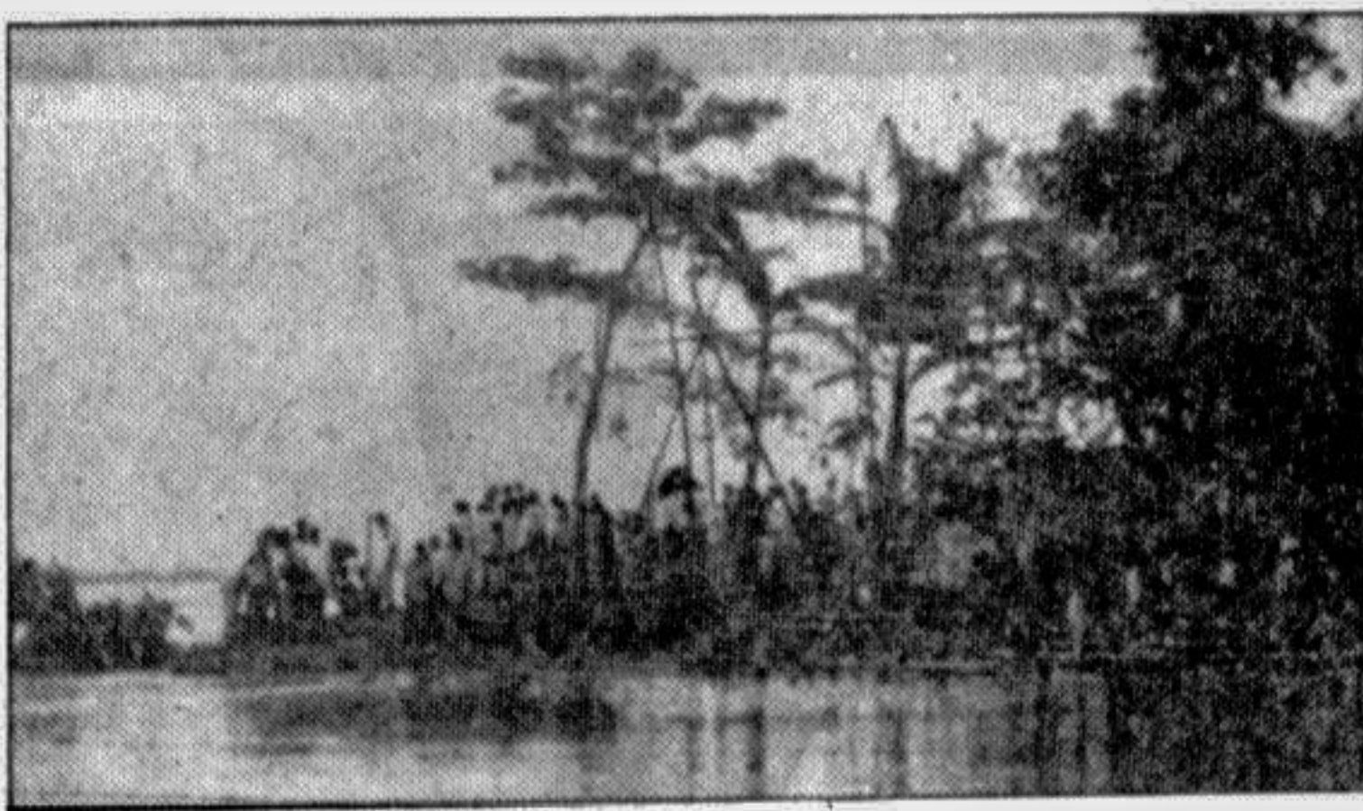
RANGPUR: A view of bamboo piling work to protect erosion along right bank of the river Teesta of Gangachhara in the district.

Sexagenarian drowns RANGAMATI, Oct 2: A sexagenarian woman has been washed away by flash flood in Kassarong basin of Kaptai lake near Langalmora in Sazek union of Baghachari thana of the district while she was collecting floating firewood recently, police sources said, reports BSS.