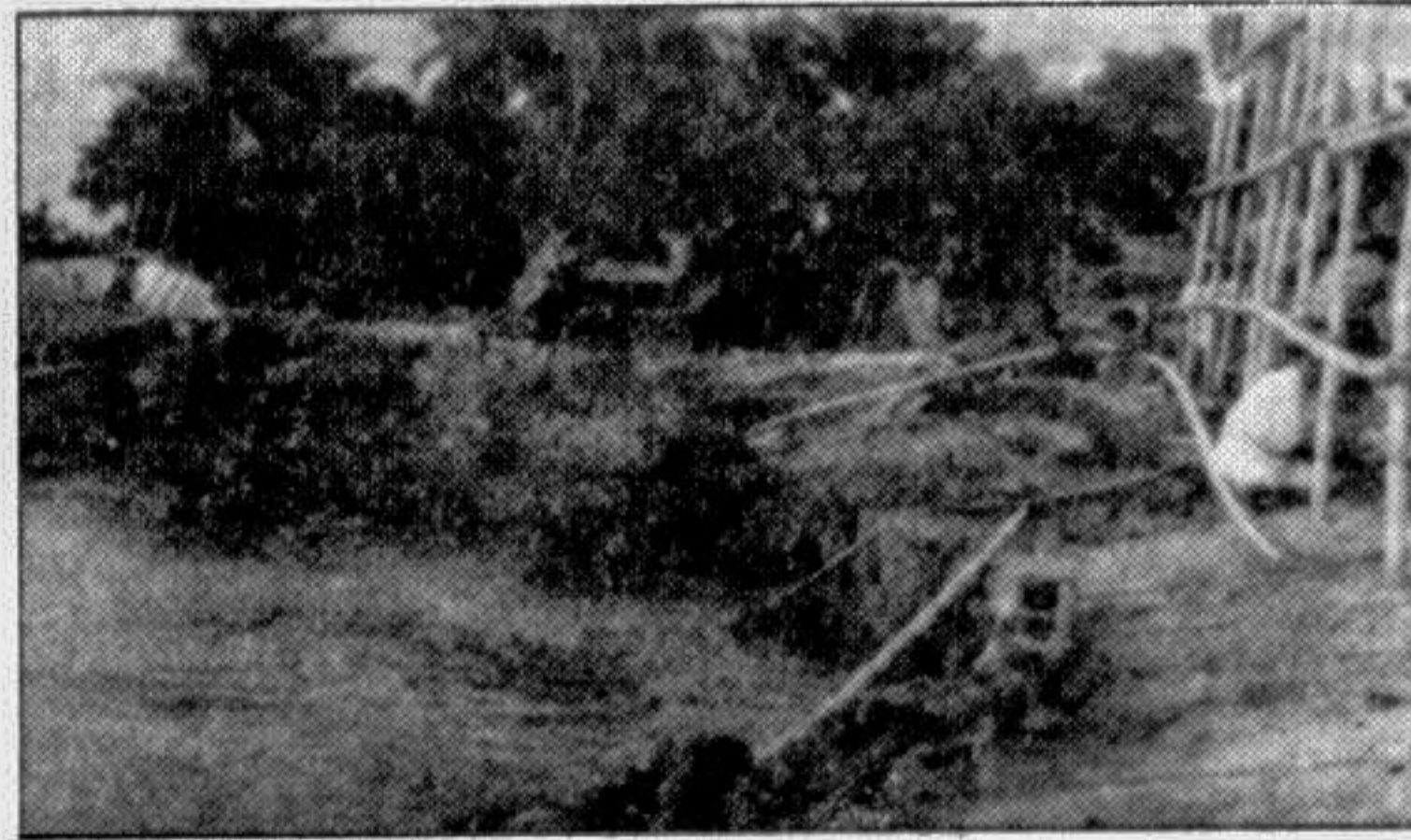
GOPALGANJ: Erosion of the river Modhumati has threatened village Hariduspur in the sadar thana. A houseowner shifting his house from the village.