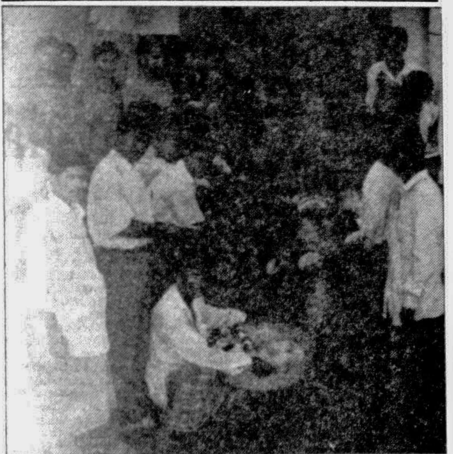
BARISAL: BRAC, a leading Non-Governmental Organisation (NGO) recently distributed bread among the flood victims at Kasemabad Siddiquia Alia Madrasa in Gournadi thana.

RANGAMATI, Oct 2: The date for identifying and enlisting the internal refugees of Chittagong Hill Tracts (CHT) has been extended upto October 15. This was decided at a meeting of CHT task force on Tribal Refugee Rehabilitation Affairs (TRRA) held recently at the local circuit house. It was also decided to identify and enlist the non-tribal people who had taken refuge due to political unrest between August 15, 1975 till August 10, 1992 in the CHT region.